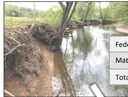
Stream restoration: Chesapeake Bay grant 2019—2020