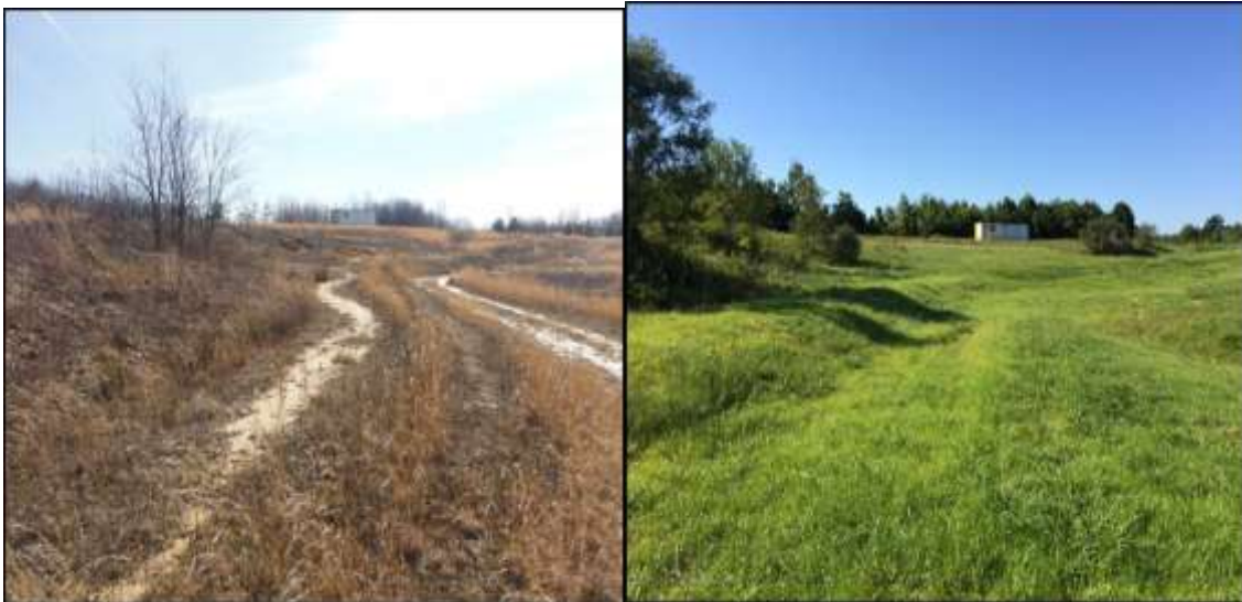
Project site. The left picture is March 2016 and the right picture is August 2017