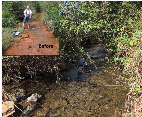
Figure 3. Kanes Creek, before and after restoration.