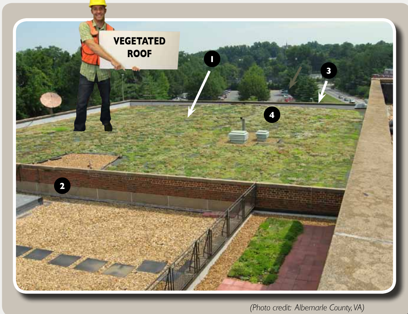
Figure VR-2. Schematic of typical Vegetated Roof