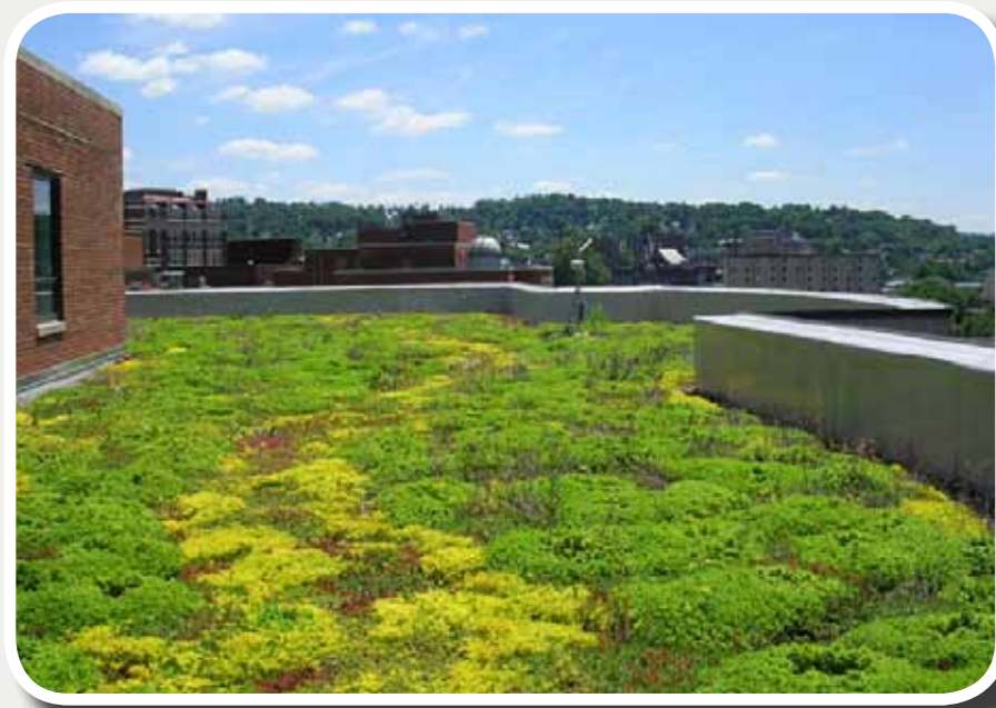
Extensive Vegetated Roof