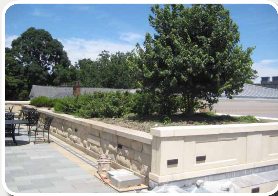
Intensive Vegetated Roof