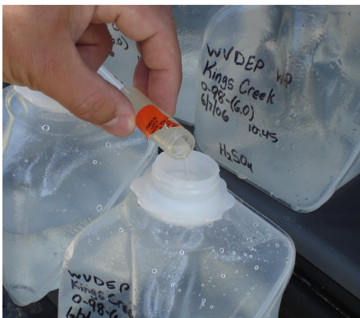
Figure -2. Example of sample being preserved with Nitric Acid.

Some samples will need to be fixed with acids before being stored. Samples that are preserved with Sulfuric Acid should always be preserved before samples that are preserved with Nitric Acid. This is because the volatile Nitric Acid vapors may contaminate Nutrient samples and give false Nitrogen results. If you do accidentally preserve the Nitric Acid sample first, then move away from that area when fixing the Sulfuric Acid (e.g., the opposite end of the vehicle or 20 feet away).