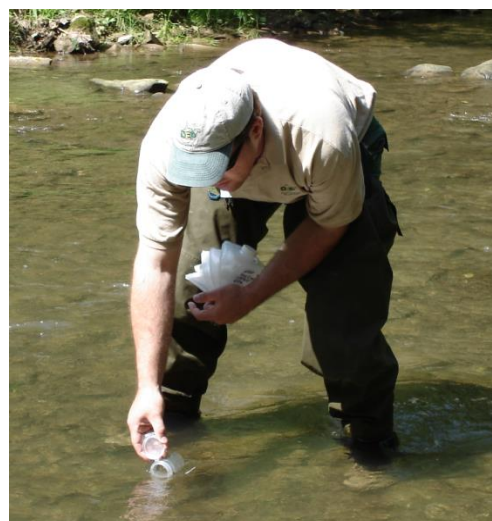
Figure-1. Example of a Fecal Sample being taken from a stream.