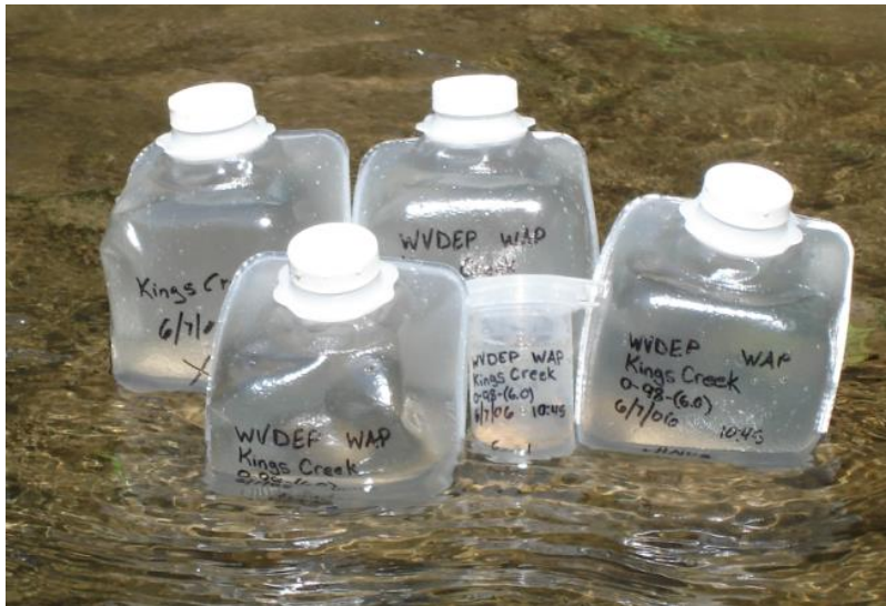
Figure 1. DEP Example of Sample Containers Labeled with sample information.

NOTE: The definitive order of sample container filling is as follows: