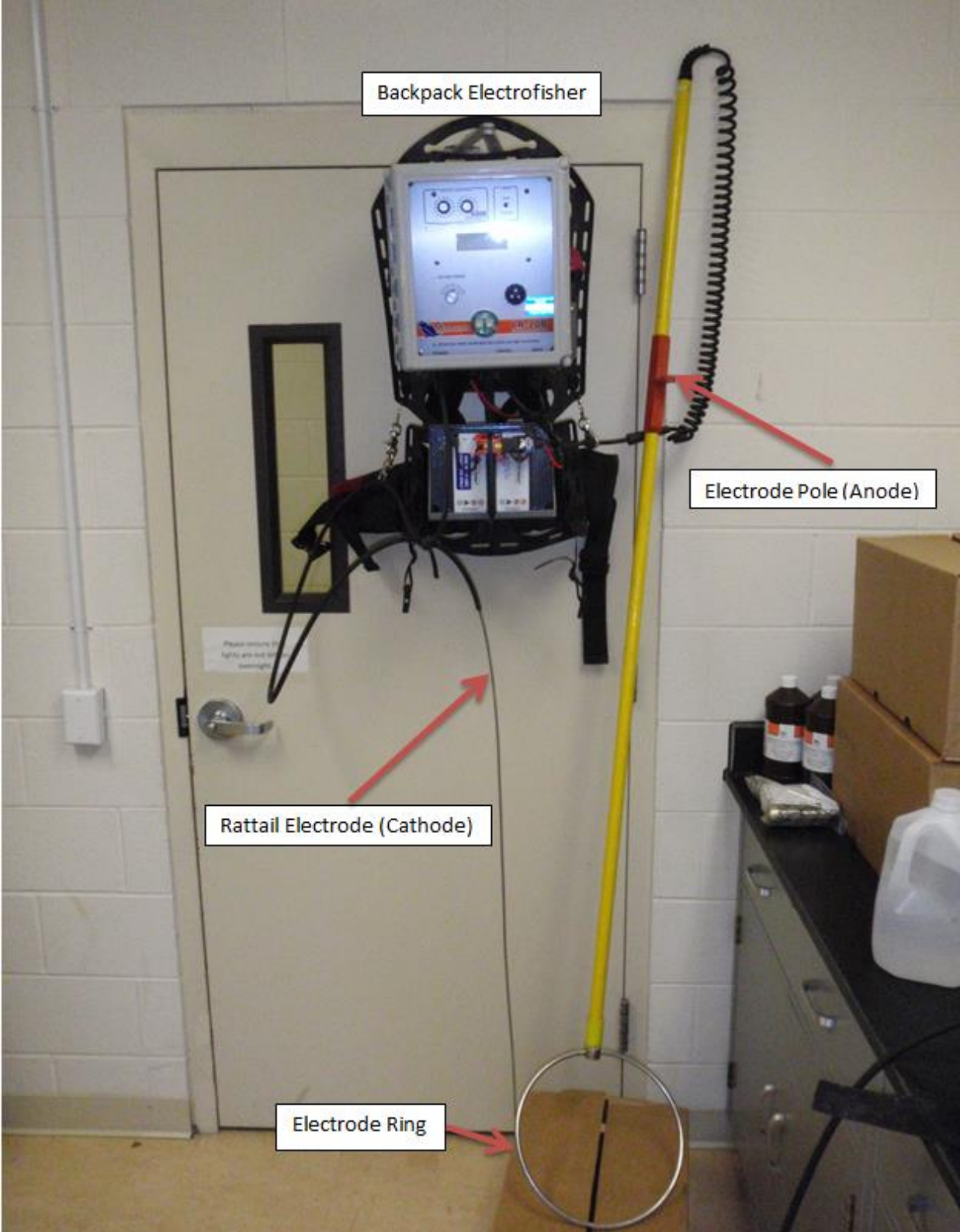
Figure 6-2. Components of a backpack electrofishing system.