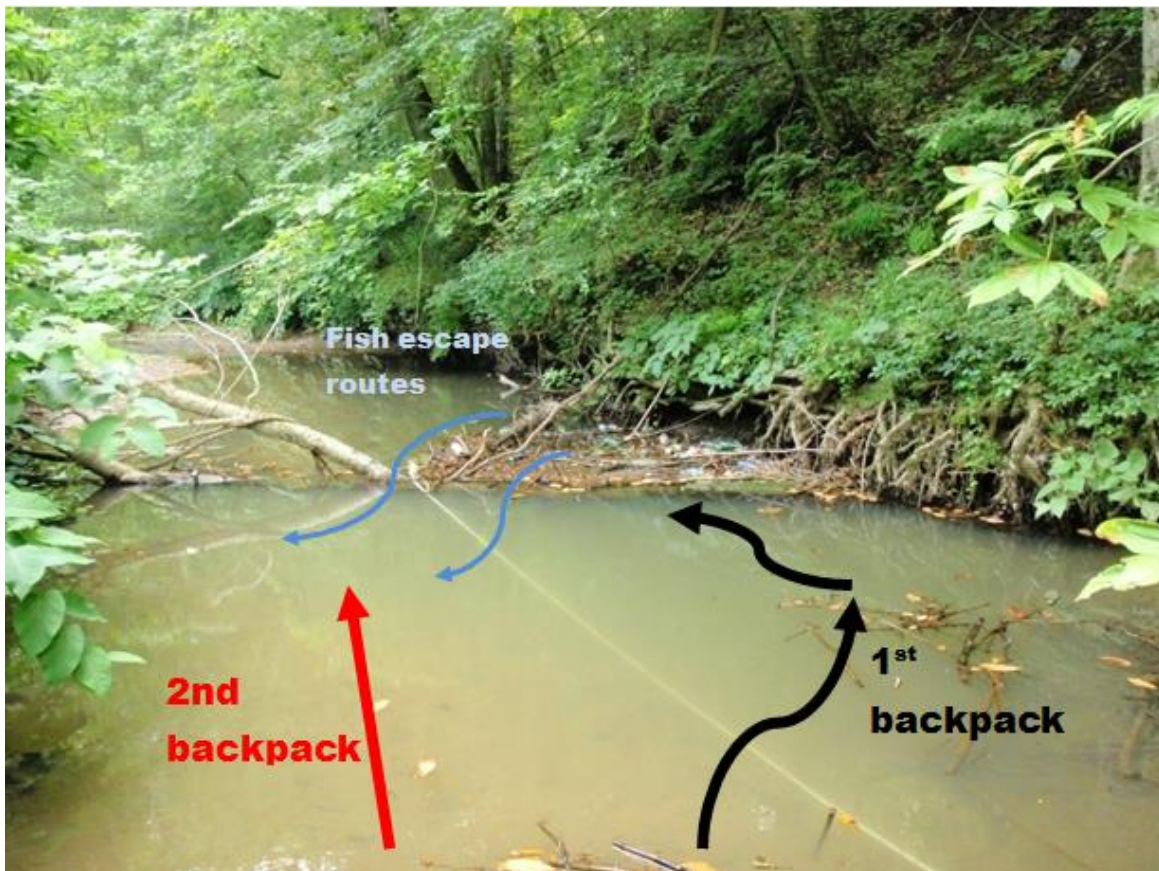
Figure 6-4. Technique for sampling a deep, narrow stream with two backpacks, looking upstream.

should be used. The decision should be made by the crew leader as to whether the backpacks are adequate to obtain a representative sample. If not, then the stream should not be sampled as it would result in a non-comparable sample.