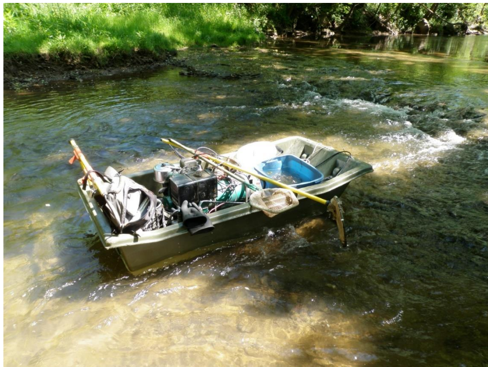
Figure 6-6. Tow barge with generator, live well, and shocking wand.

Note the two electrofisher anodes and rings in front of the crew on left and tow barge in background on right.