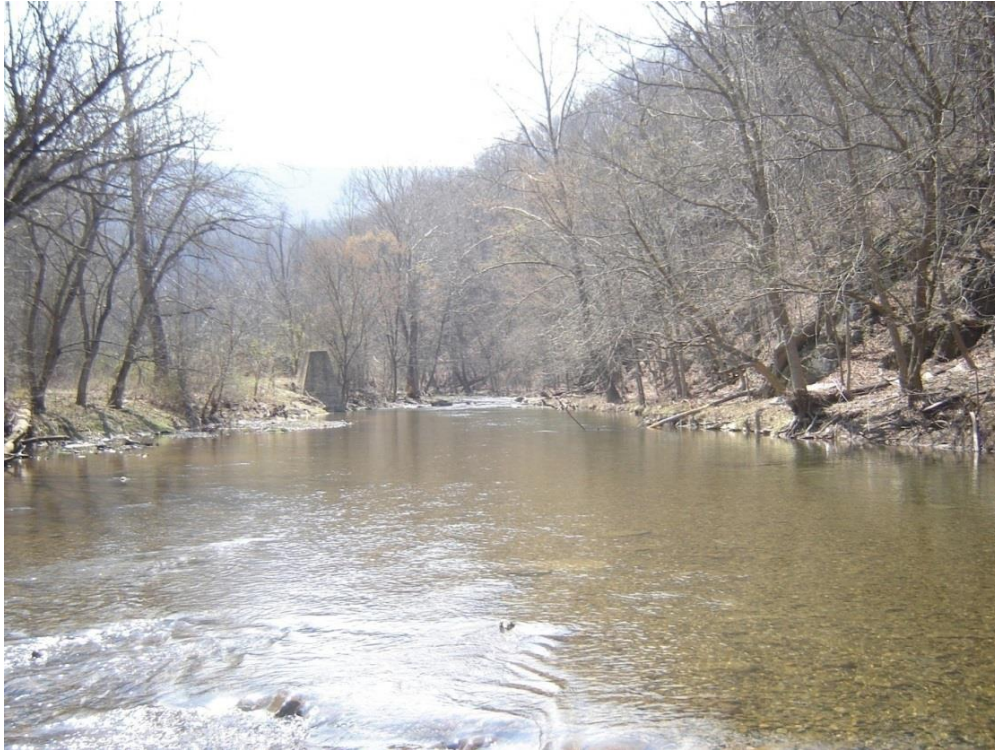
Figure 6-7. Reach type requiring barge electrofisher. Note the large width and lack of constraining features or habitat.

In a stream with multiple or braided channels ( see Figure 6-8 on next page ), each channel should be electrofished. Using one backpack, select a channel and shock it upstream to the point where the main channel splits. Walk back down that channel to the starting point and then begin working up the next channel. Continue this pattern until all available channels have been sampled. If additional backpacks and crewmembers are available, then all channels can be sampled simultaneously. When sampling a stream with substantial quantities of a specific cover type ( e.g. , boulders, logs, undercut banks, overhanging vegetation), focus your effort on that habitat. Most species of fish tend to hide as a first response to disturbance. Use the anode to draw fish out of the cover where they can easily be netted. If the proper settings are used, the anode will work like a magnet and the fish will swim to the anode.