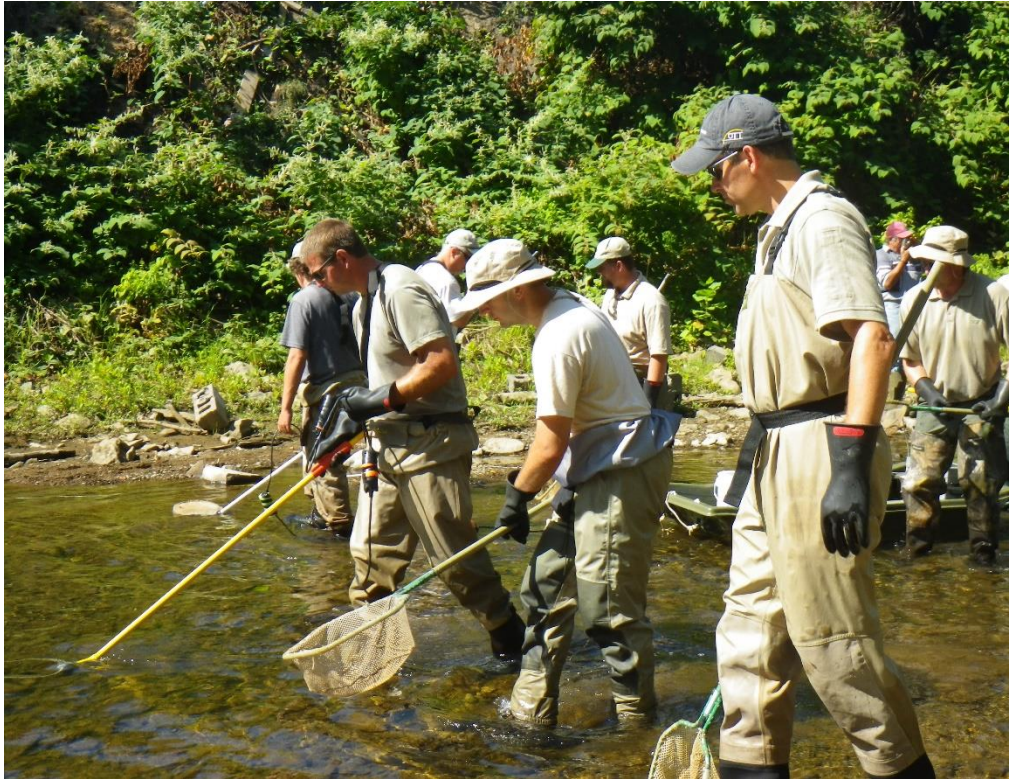
Figure 6-5. Electrofishing using a Tow Barge

Note the two electrofisher anodes and rings in front of the crew on left and tow barge in background on right.