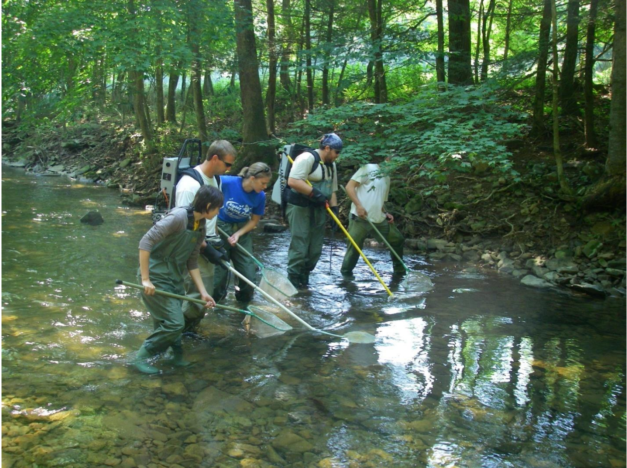
Figure 6-3. An electrofishing crew consisting of two backpack shockers (electrofishers) and three netters.

In streams four to eight meters wide and in deeper, trough-like streams less than four meters wide (often associated with reduced visibility), two backpack electrofishers will be used ( see Figure 6-3 above ). The two electrofishers will parallel each other working side to side in an upstream direction ( see Figure 6-4 on next page ).