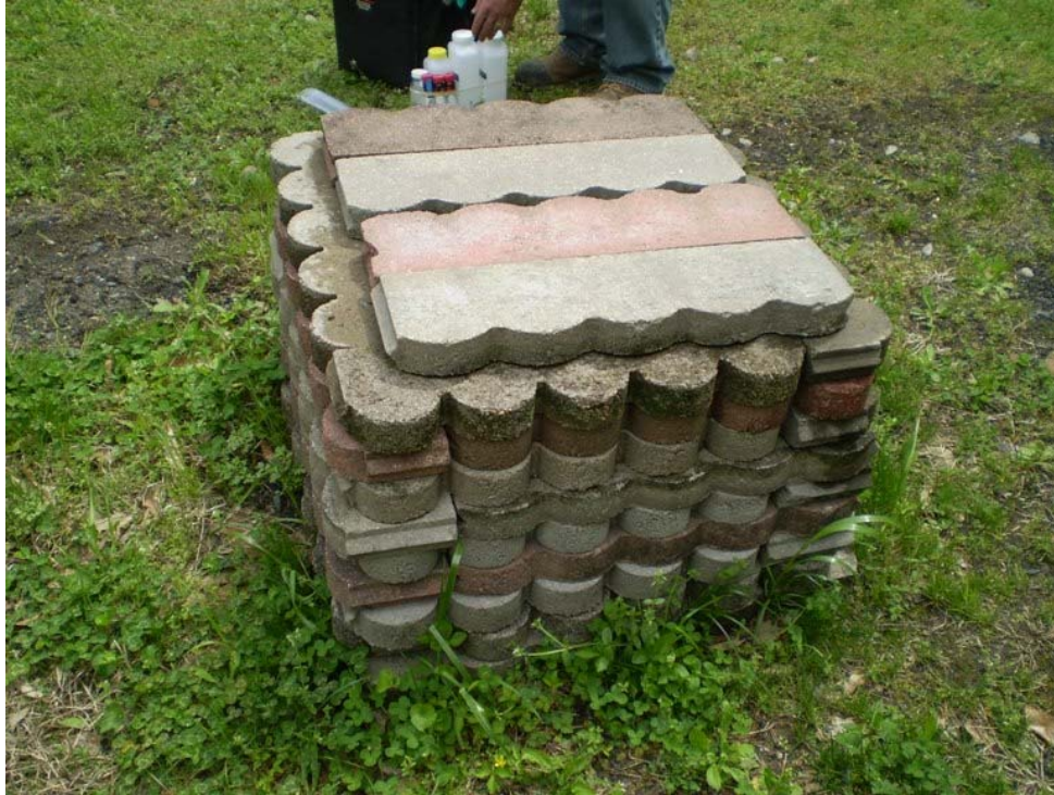
Photograph # 29: View of well house – sample DW-12.