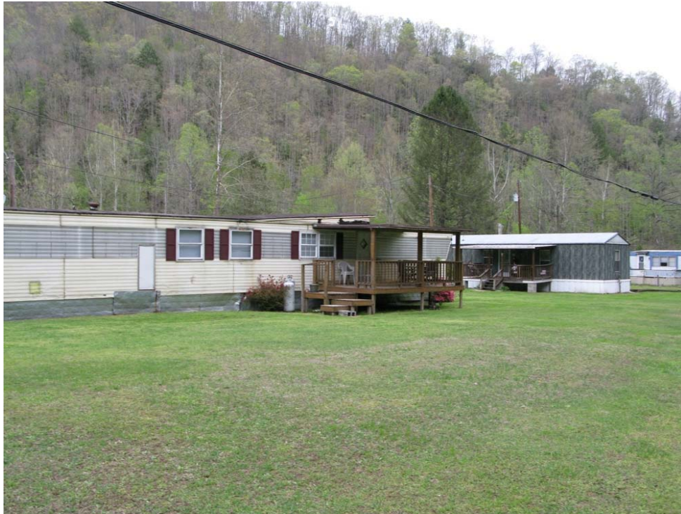
Photograph # 45: Residential area served by DW-20.