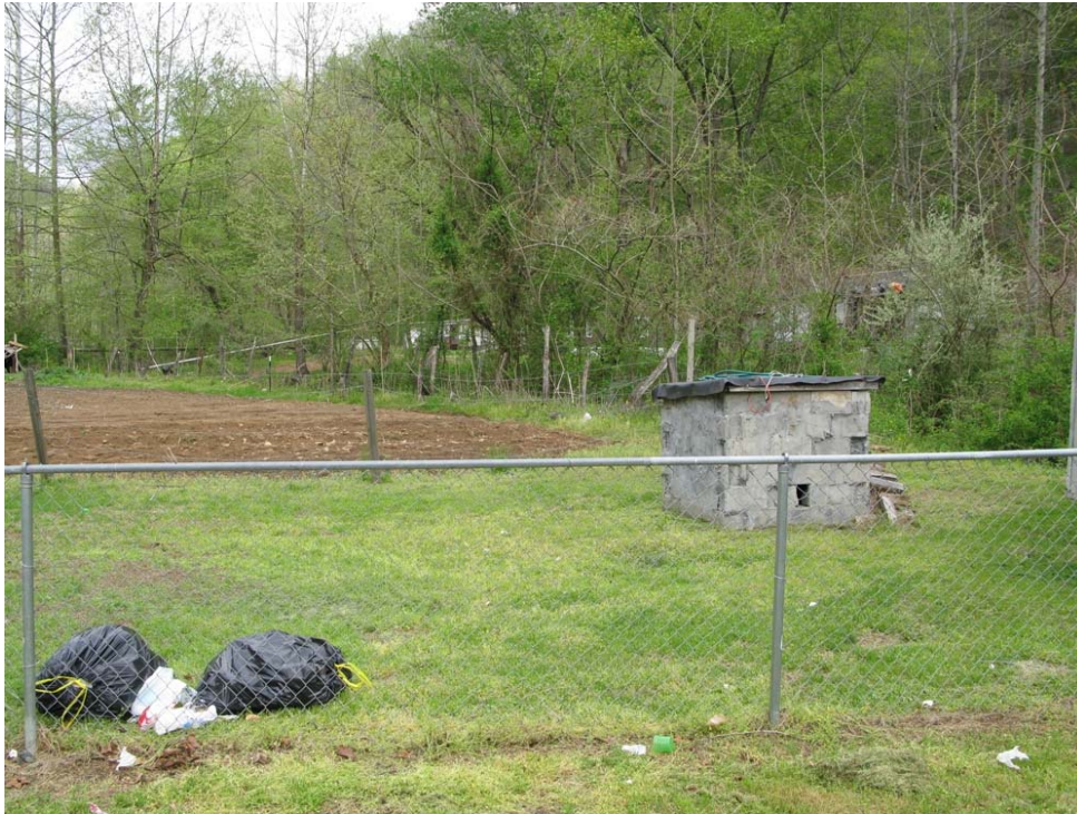
Photograph # 27: View of well house – sample DW-11.