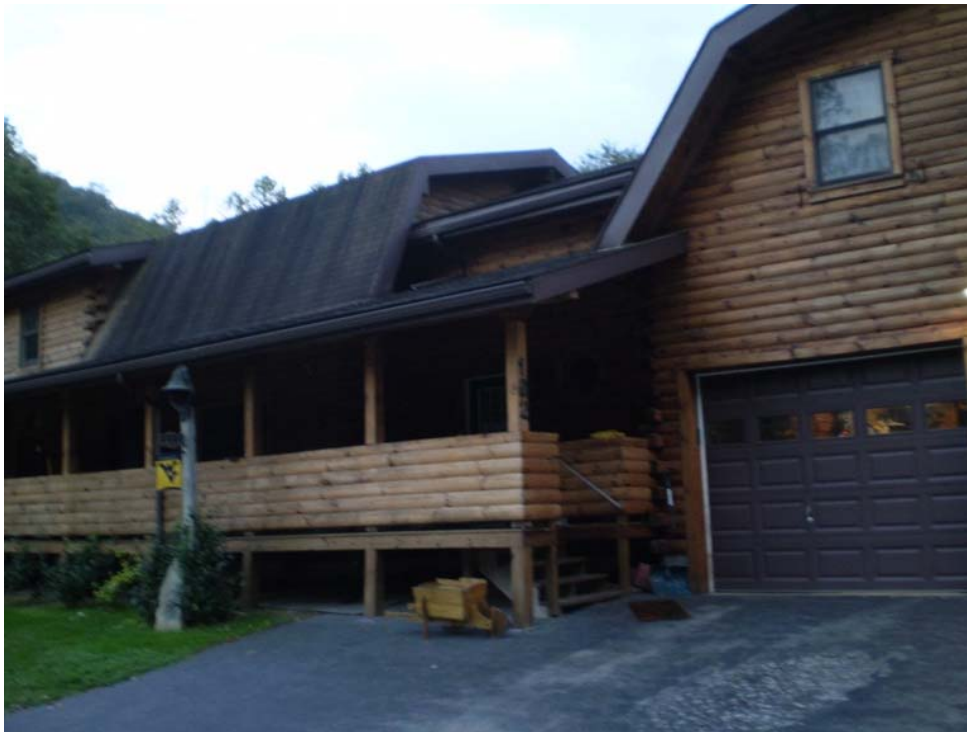
Photograph # 70: View of residence served by DW-32.