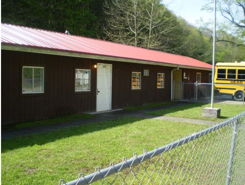
Photograph # 57: View of community center served by DW-27.