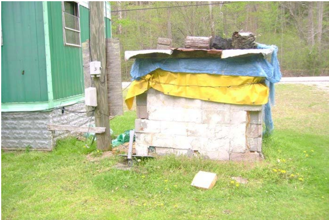
Photograph # 44: View of well house – sample DW-19.