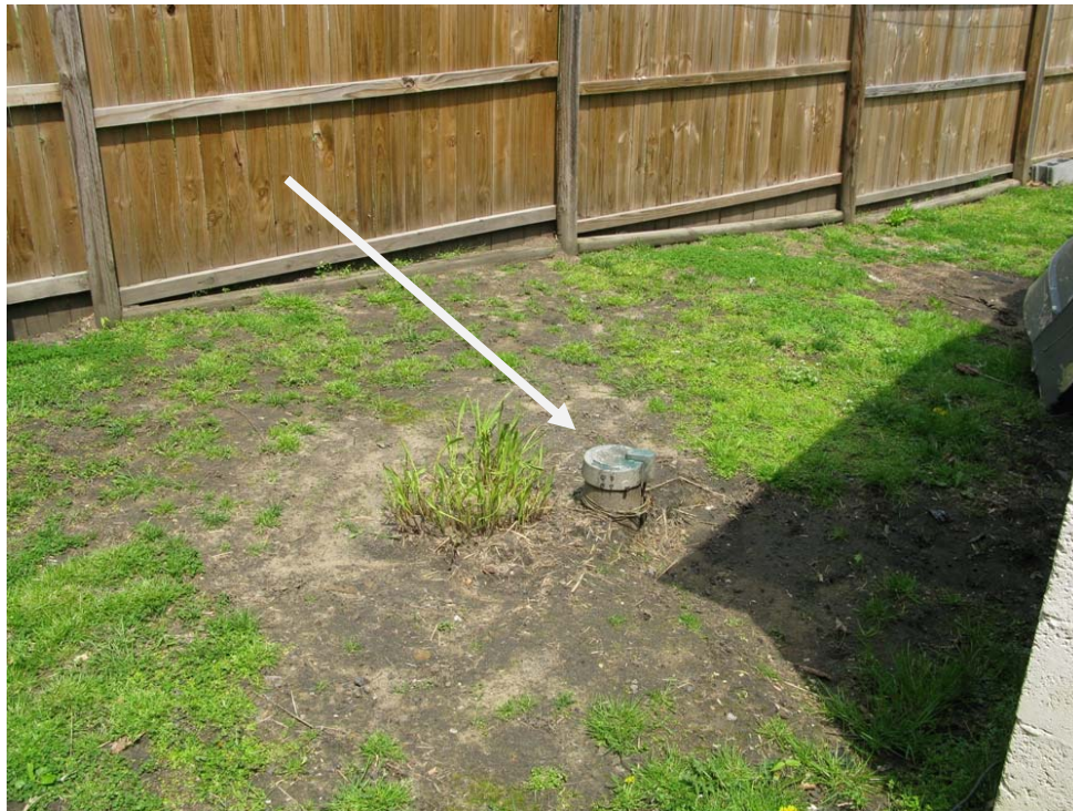
Photograph # 20: View of well head – sample DW-7.