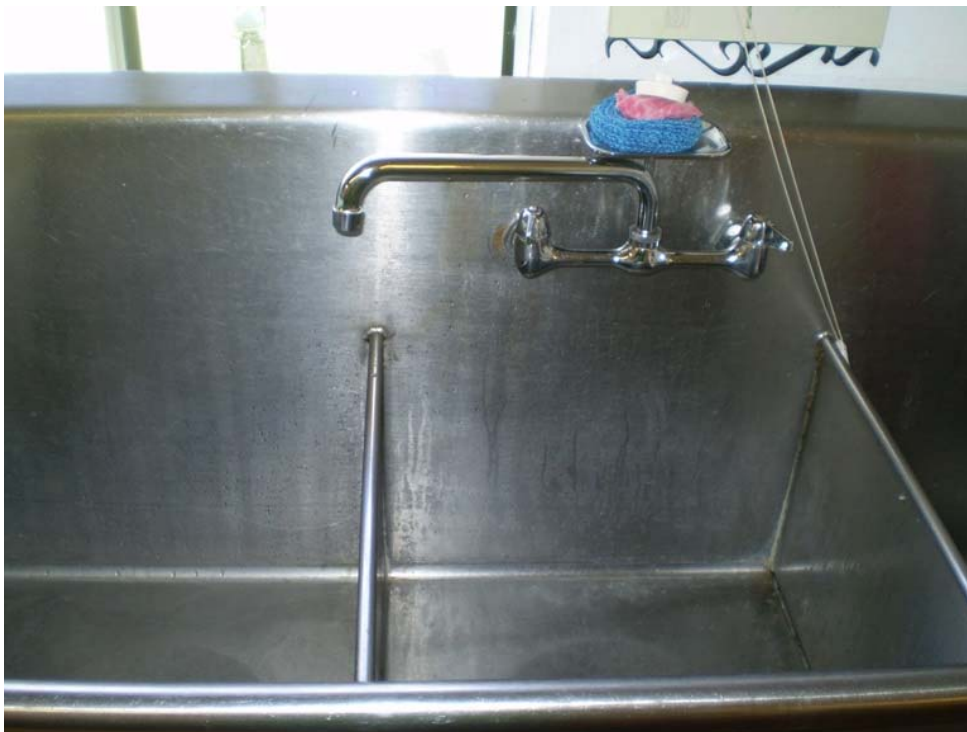
Photograph # 58: View of faucet from which sample DW-27 was collected.