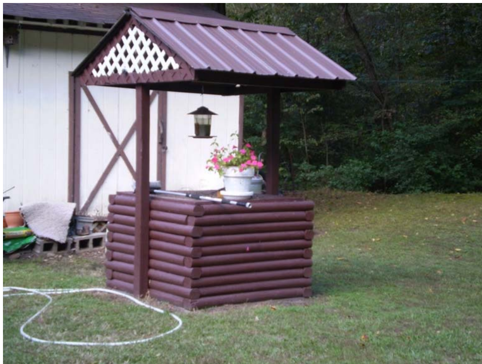
Photograph # 60: View of well – sample DW-28.