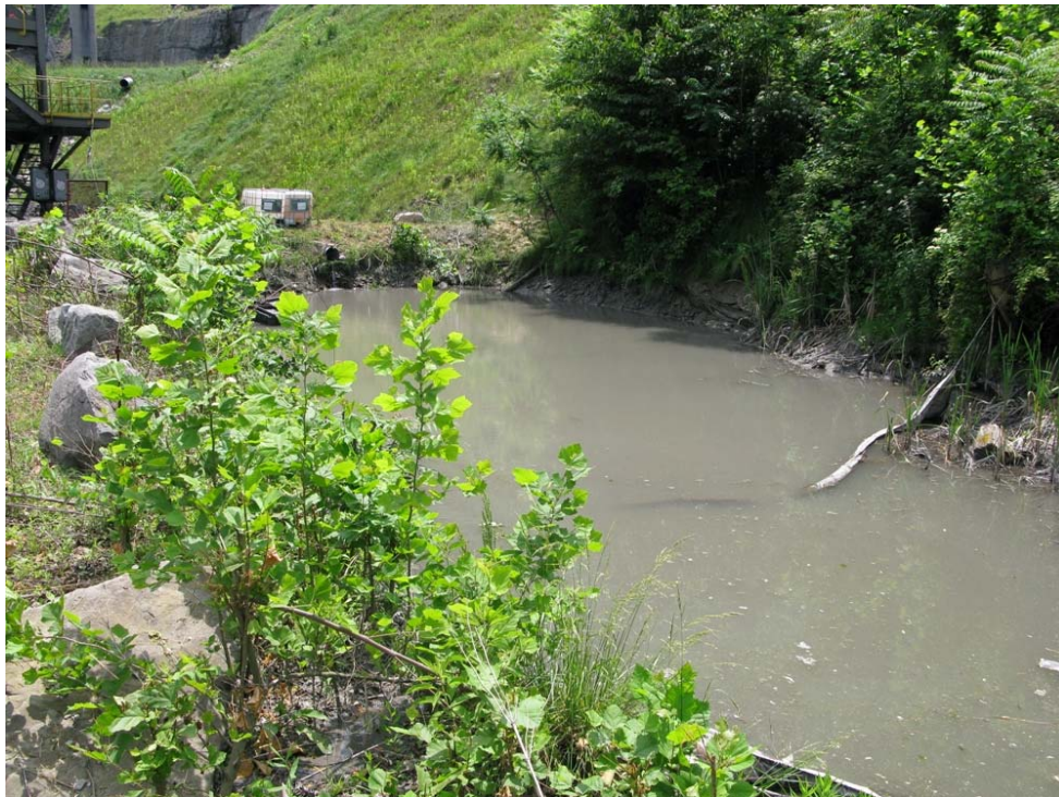
Photograph # 12: View of sample IW-01.