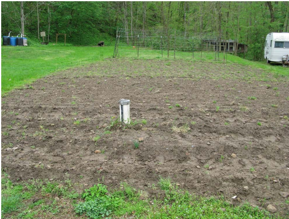
Photograph # 4: View of well – sample DW-2.