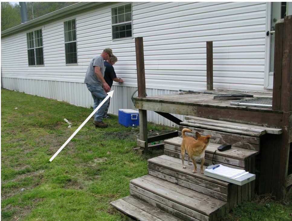
Photograph # 28: View of hose bib – sample DW-11.