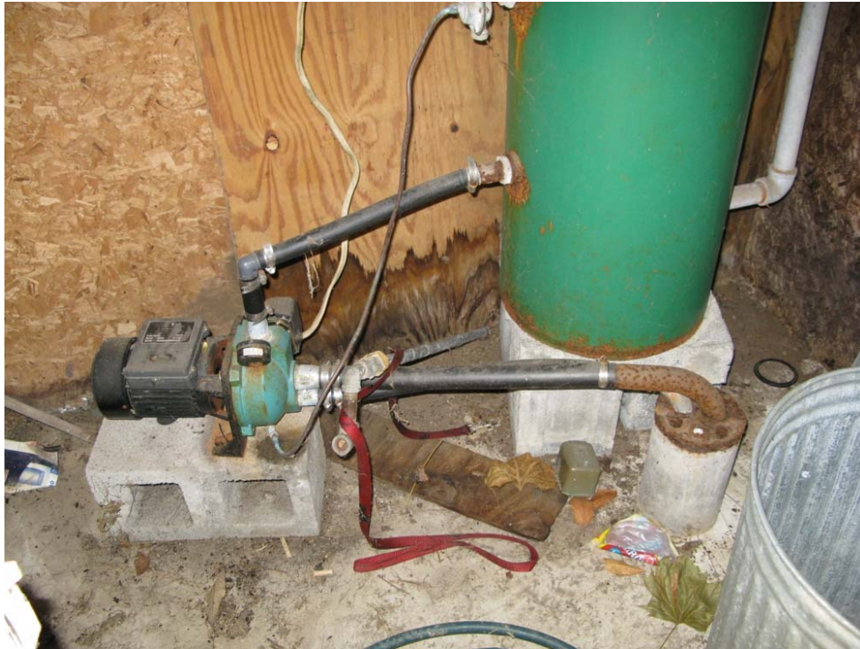
Photograph # 41: View of pump – sample DW-18.