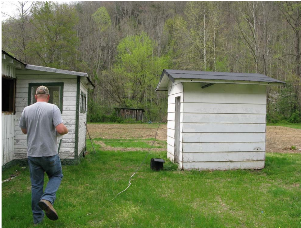
Photograph # 40: View of pump house – sample DW-18.