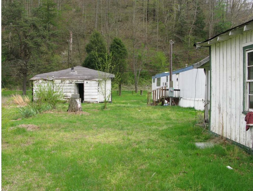
Photograph # 43: View of septic area – sample DW-18.