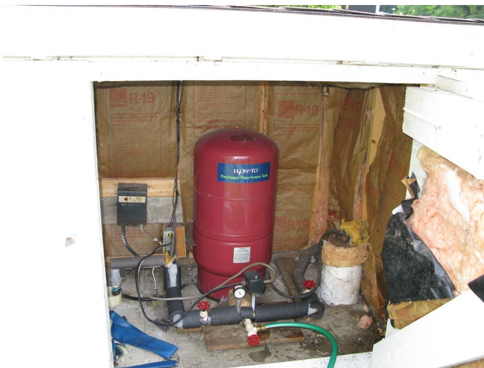
Photograph # 52: View of pump– sample DW-23.