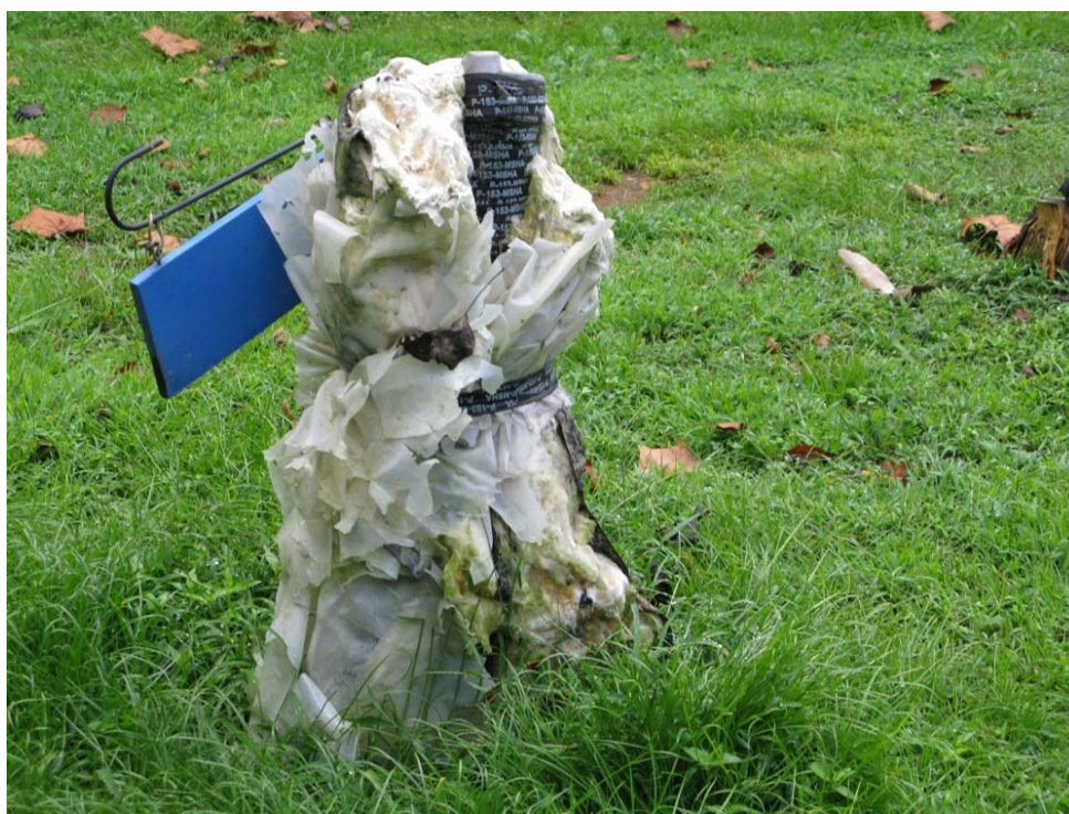
Photograph # 54: View of well head – sample DW-25.