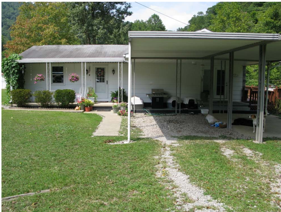
Photograph # 50: View of residence served by DW-23.