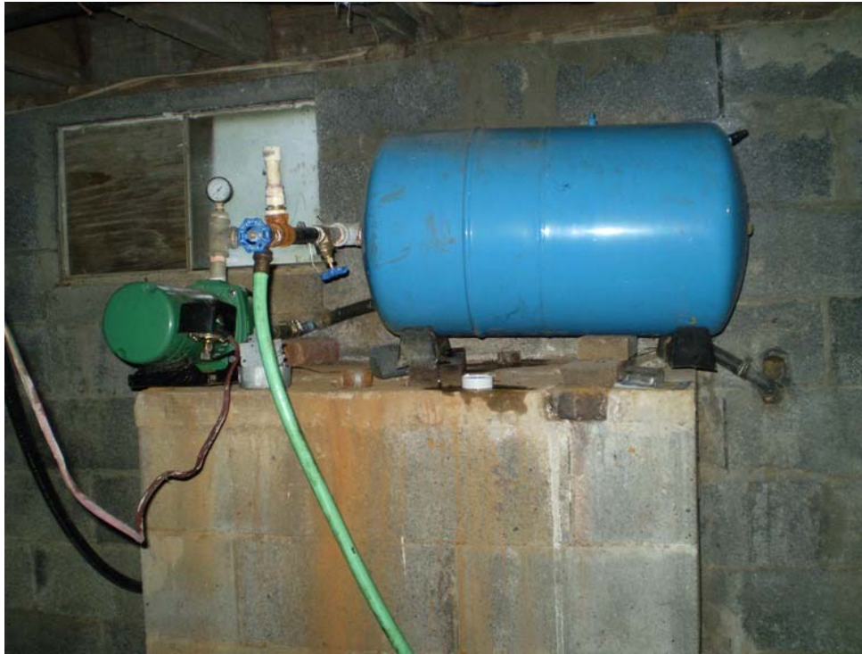
Photograph # 69: View of pump – sample DW-31.