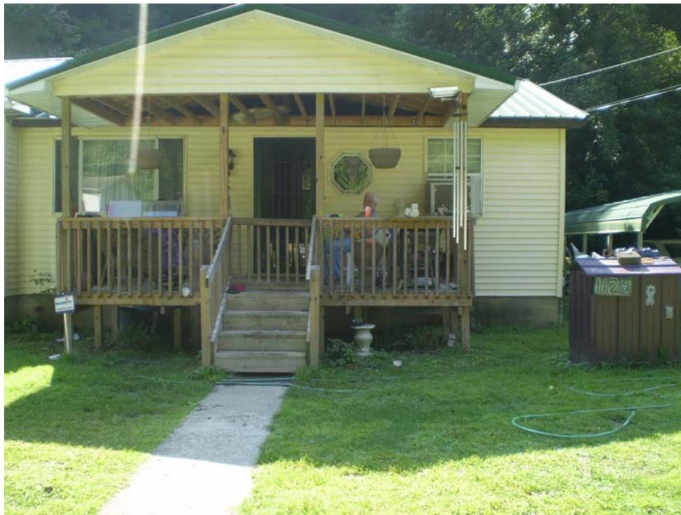
Photograph # 31: View of residence served by DW-13.