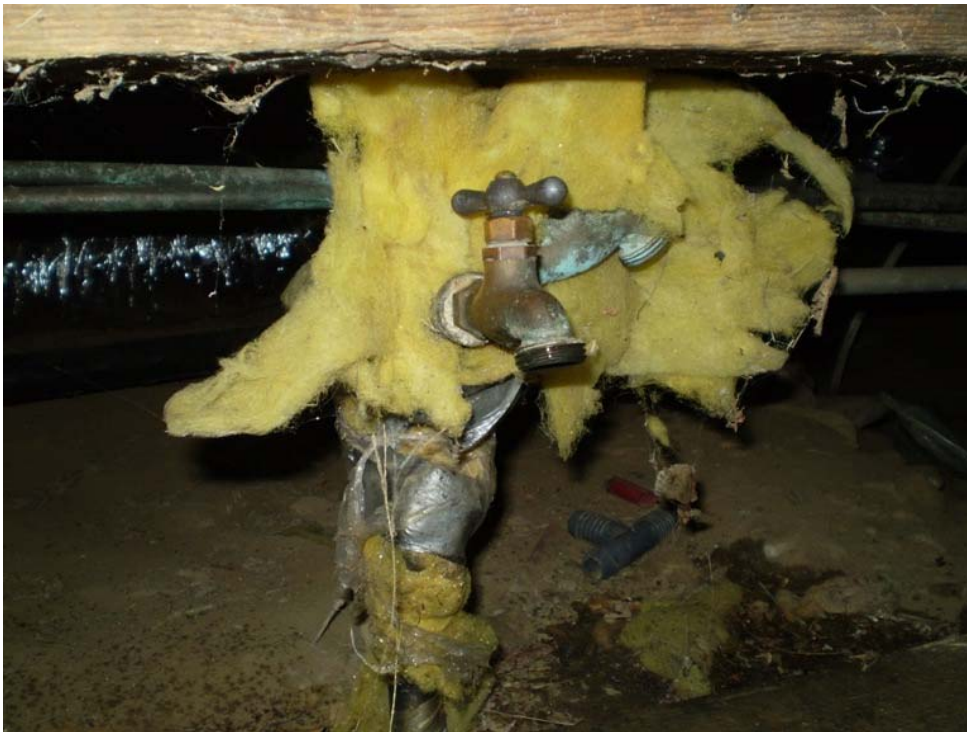
Photograph # 62: View of hose bib – sample DW-29.