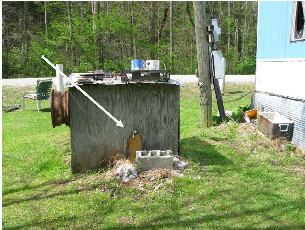
Photograph # 38: View of hose bib – sample DW-17.