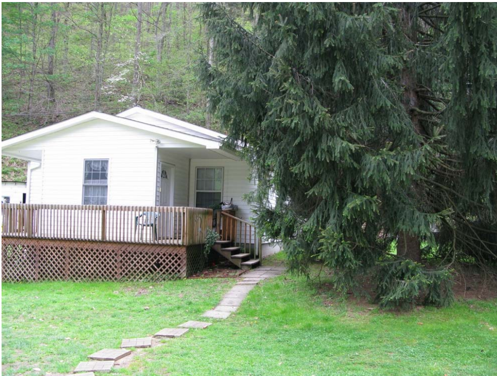
Photograph # 12: View of residence served by DW-4.