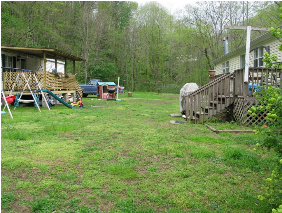
Photograph # 6: View of septic area – sample DW-2.