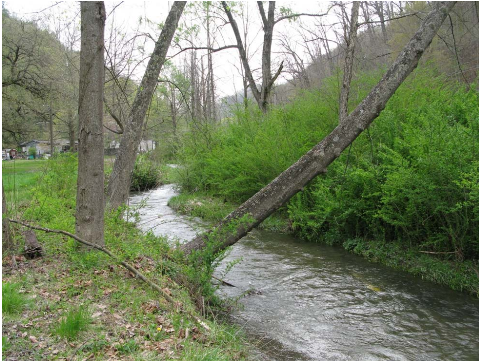
Photograph # 1: View of approximate location of SW-1.