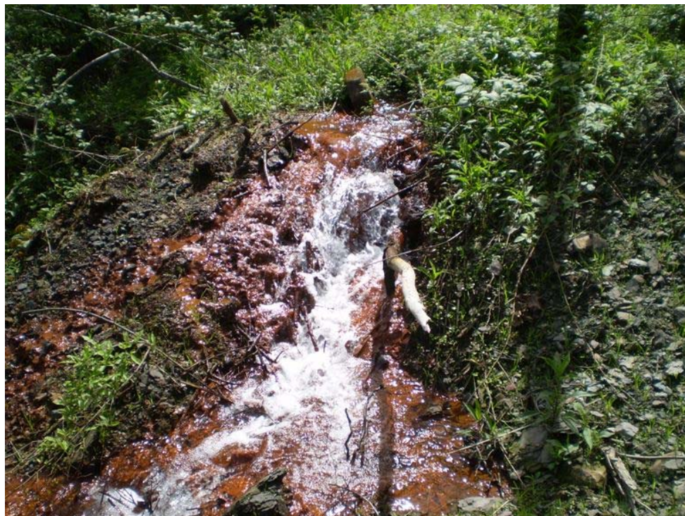
Photograph # 14: View of Lott's Fork Toe