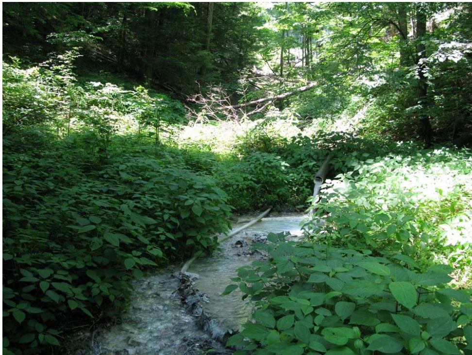
Photograph # 24: View of approximate location of sample MD-04.