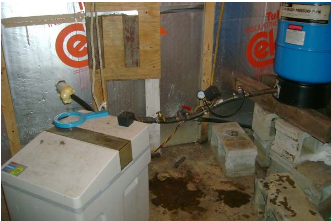
Photograph # 2: View of pump – sample DW-1.