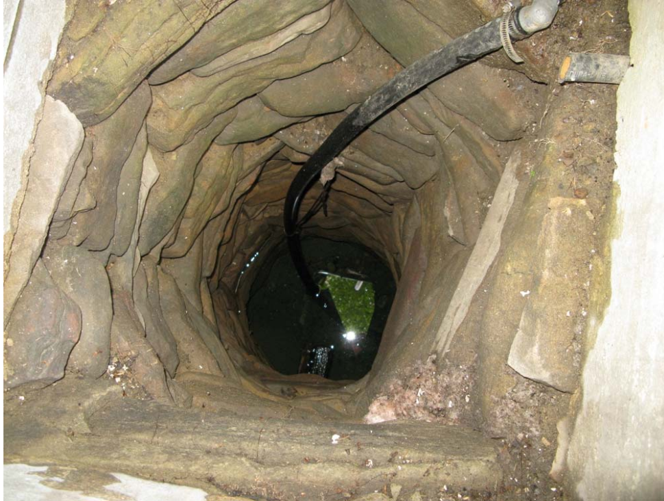
Photograph # 35: View of well interior – sample DW-15.