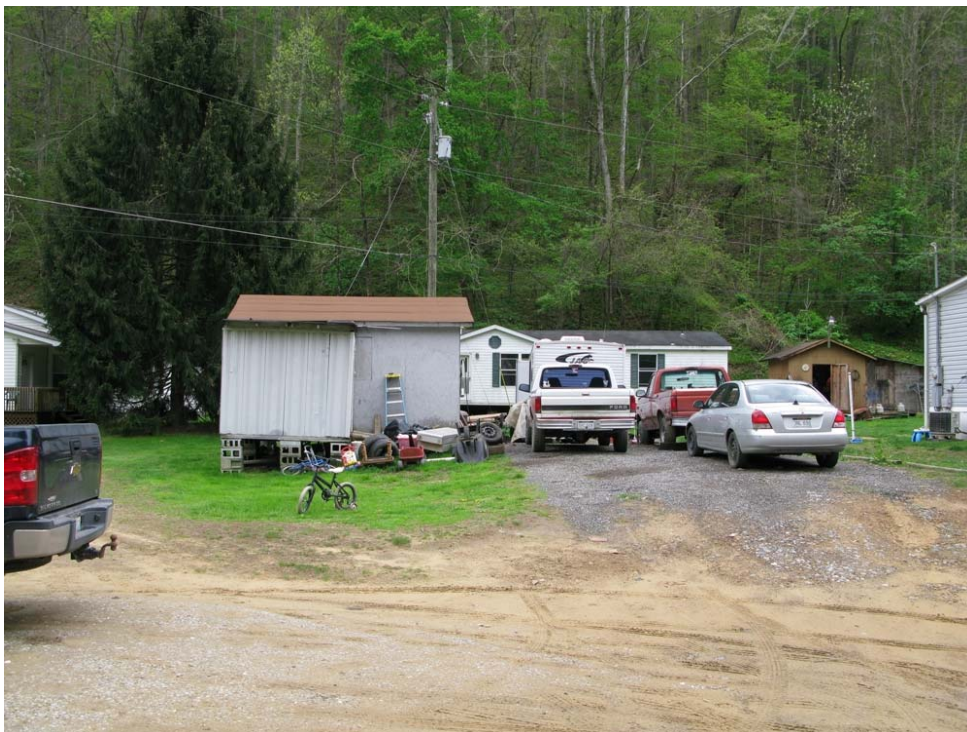
Photograph # 8: View of an additional residence served by DW-3.