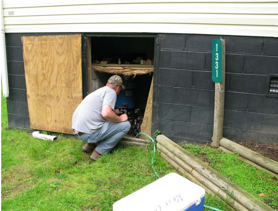
Photograph # 5: View of pump – sample DW-2.