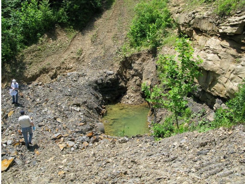
Photograph # 21: View of area from which sample MD-02 was collected.