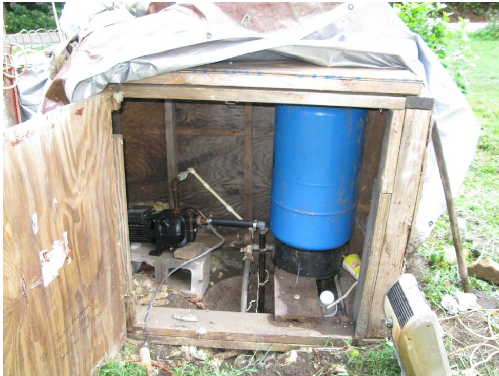
Photograph # 56: View of pump – sample DW-26.