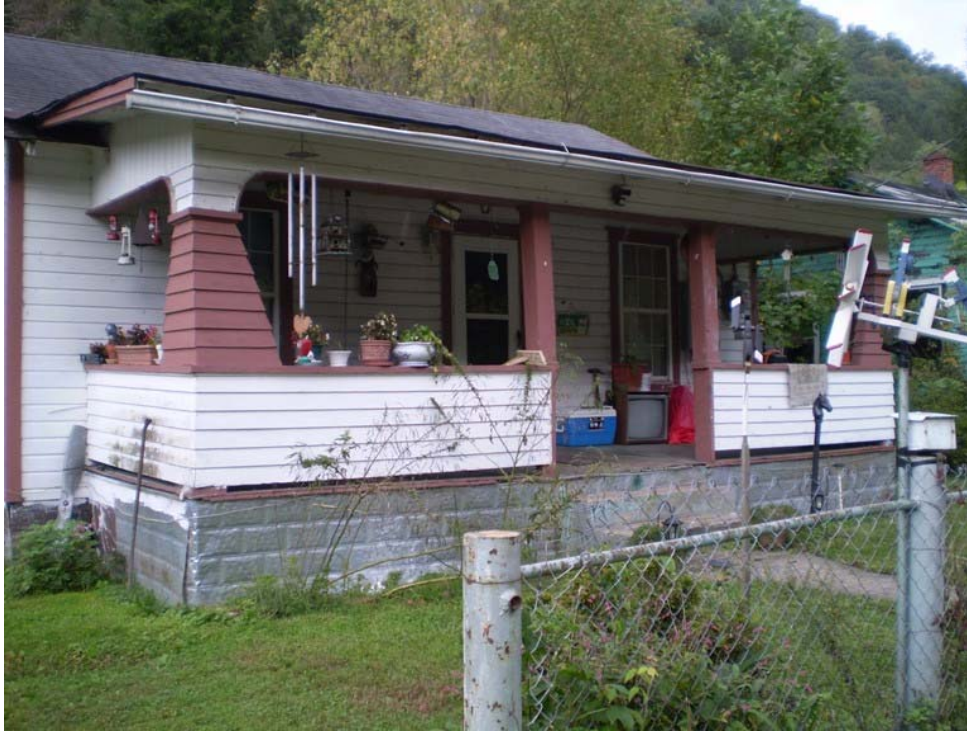
Photograph # 61: View of residence served by DW-29.