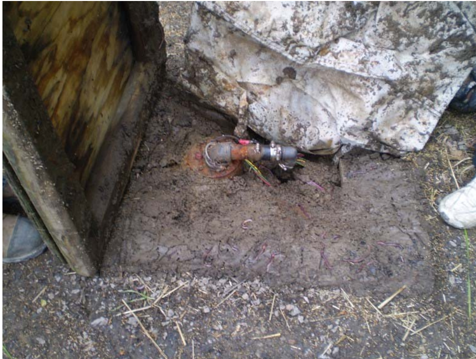
Photograph # 25: View of well head – sample DW-9.