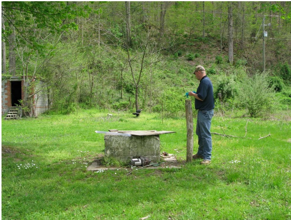
Photograph # 34: View of well – sample DW-15.