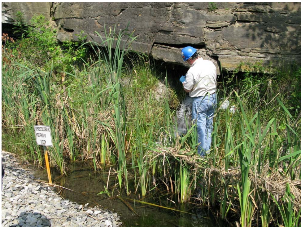
Photograph # 20: View of approximate location of sample MD-01.