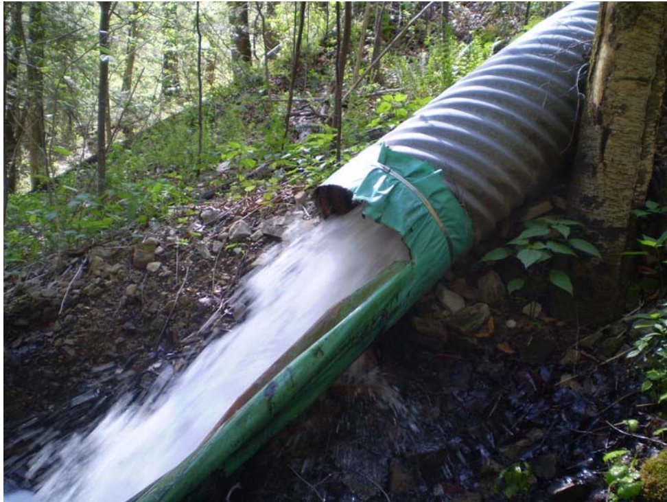
Photograph # 19: View of Outlet 20 a.