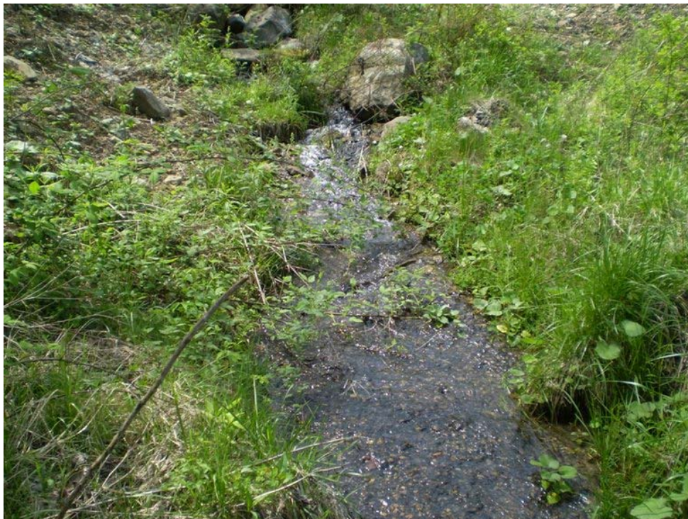
Photograph # 16: View of Right Groin.