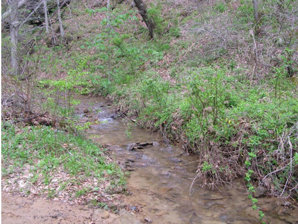
Photograph # 5: View of approximate location of sample SW-6.