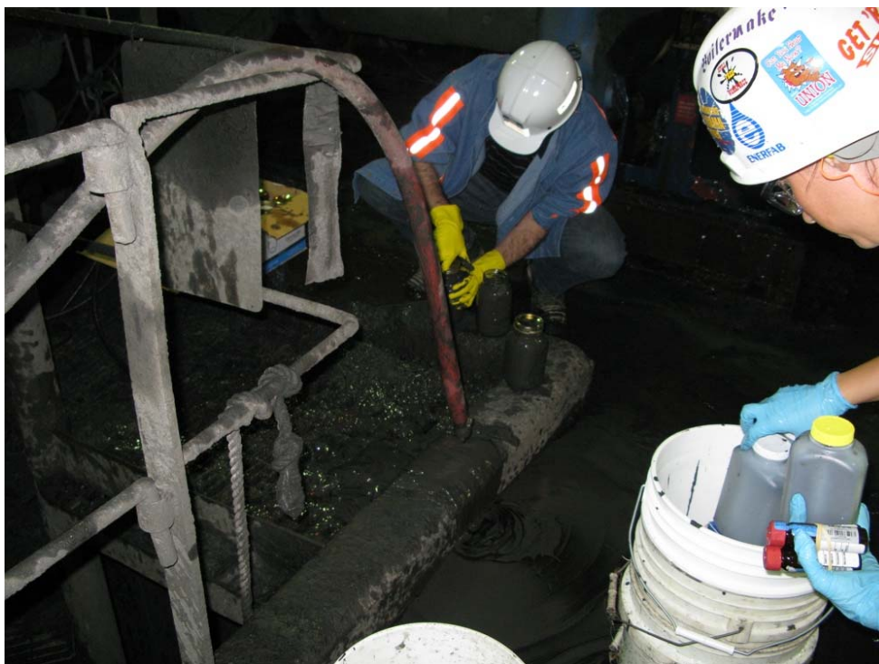
Photograph # 33: View of approximate location of sample SL-01.