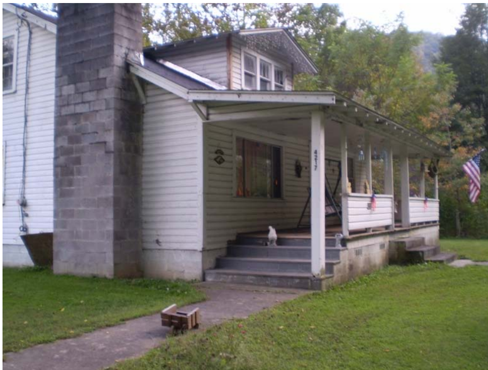
Photograph # 66: View of residence served by DW-31.