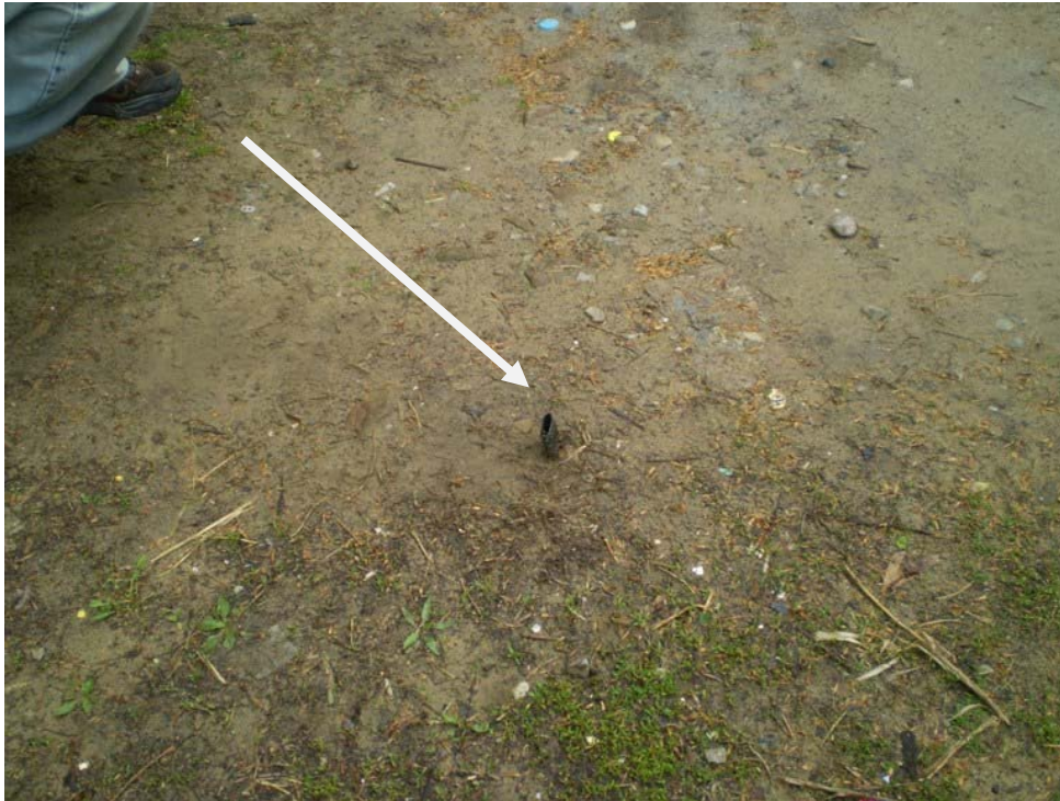
Photograph # 15: View of well – sample DW-5.