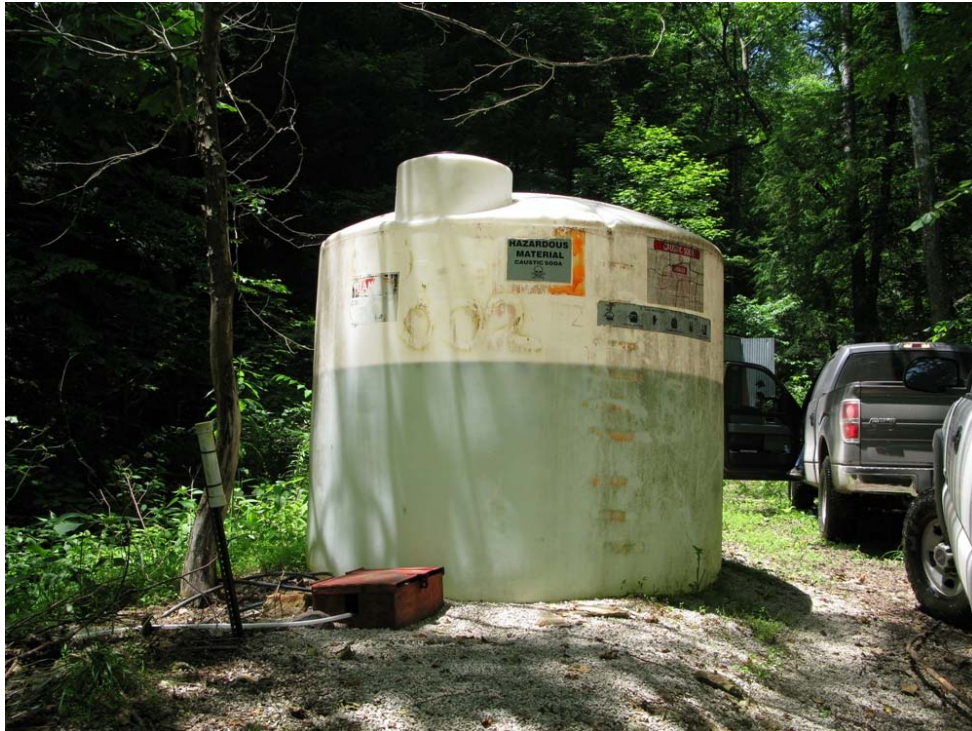
Photograph # 25: View of treatment tank – MD-04.