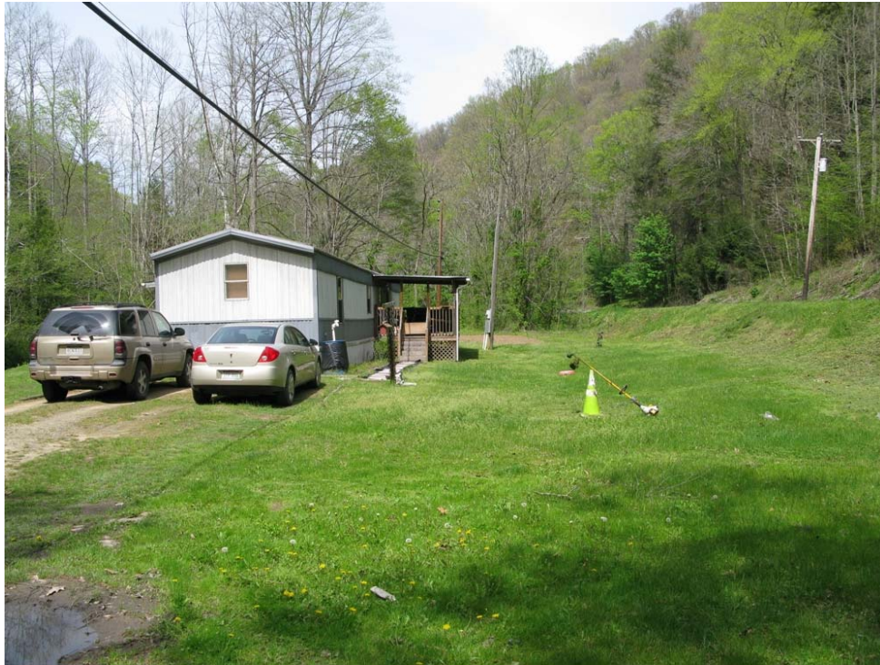
Photograph # 33: View of residence served by DW-15.