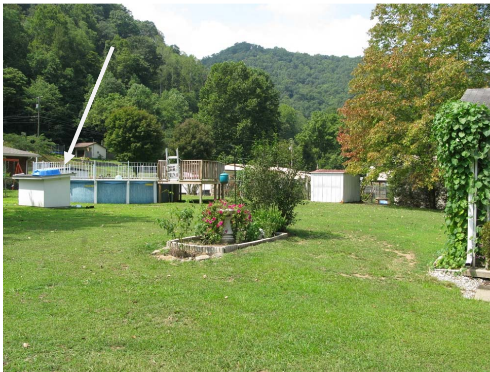
Photograph # 51: View of pump house – sample DW-23.