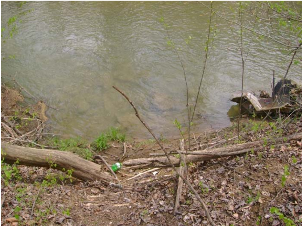
Photograph # 3: View of approximate location of sample SW-3.