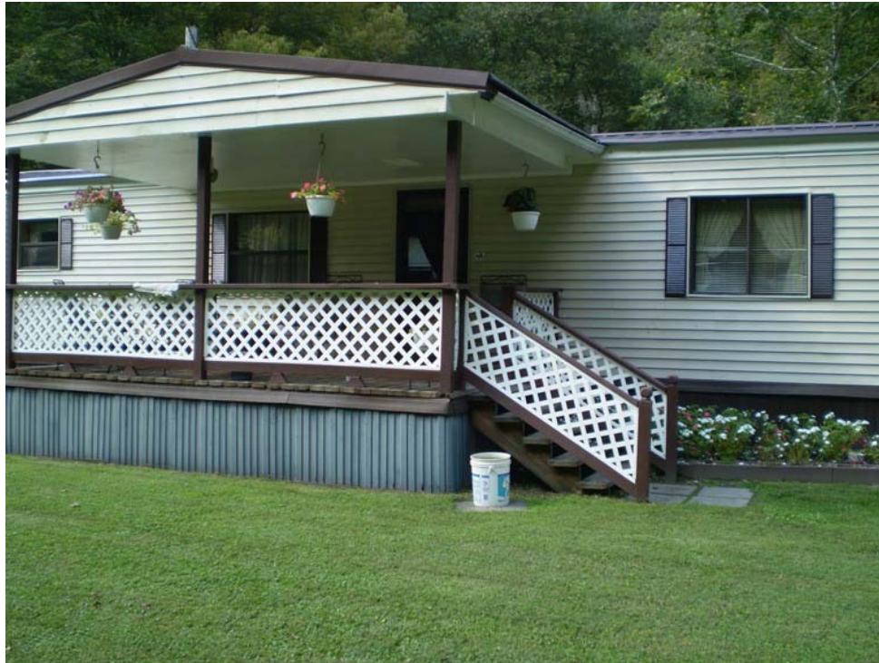
Photograph # 59: View of residence served by DW-28.