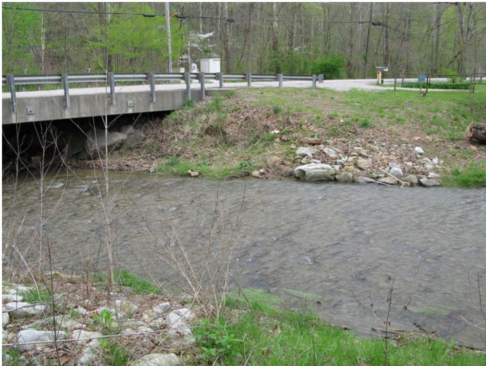
Photograph # 8: View of approximate location of sample SW-7.