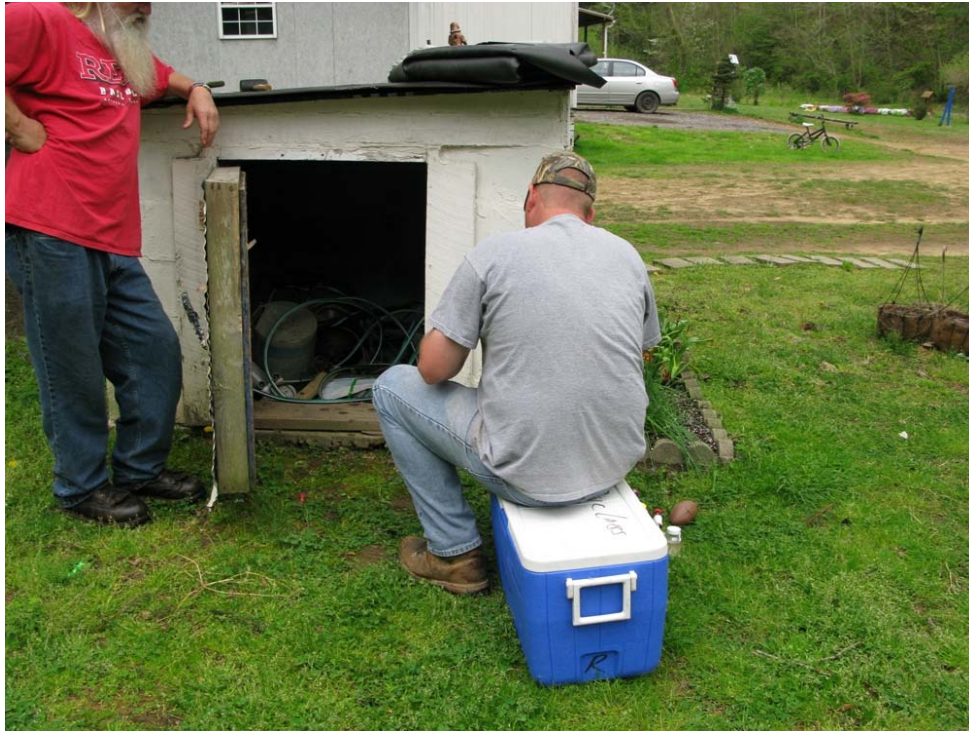
Photograph # 13: View of pump house – sample DW-4.