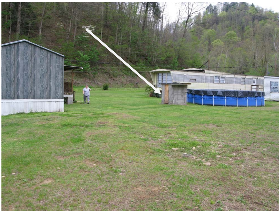
Photograph # 46: View of well house – sample DW-20.