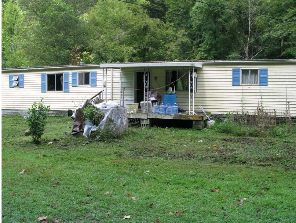
Photograph # 55: View of residence served by DW-26.