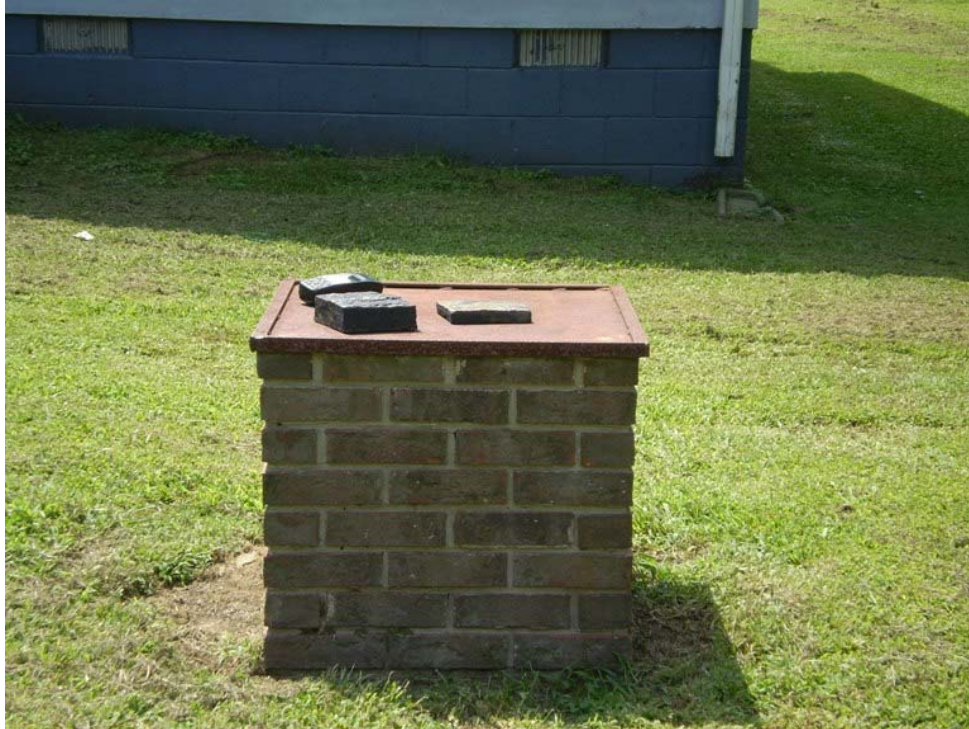
Photograph # 49: View of well – sample DW-22.