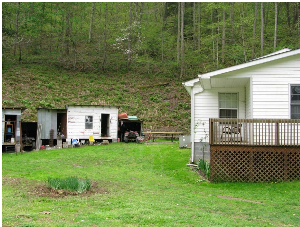
Photograph # 14: View of septic area – sample DW-4.