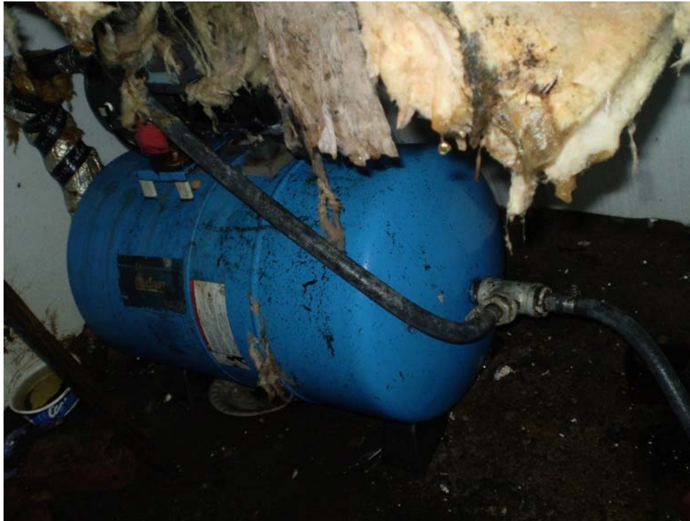
Photograph # 63: View of pump – sample DW-29.