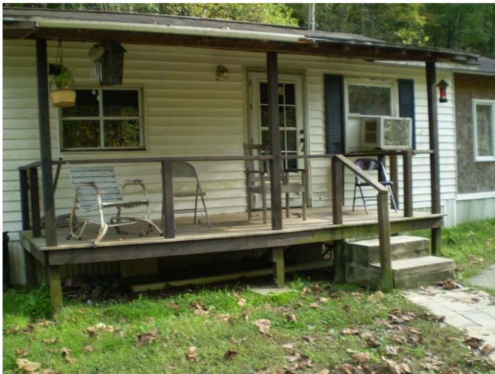
Photograph # 72: View of residence served by DW-33.