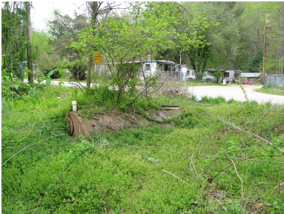
Photograph # 9: View of exposed tank and residential area near SW-7.