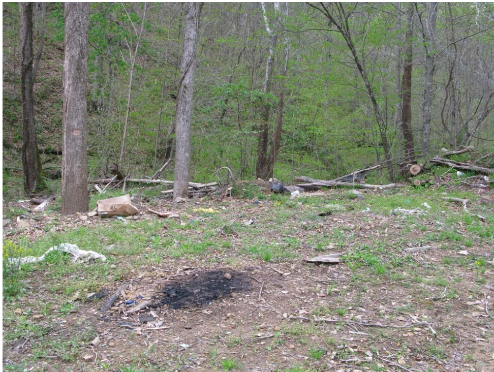
Photograph # 6: View of burning and debris area near SW-6.