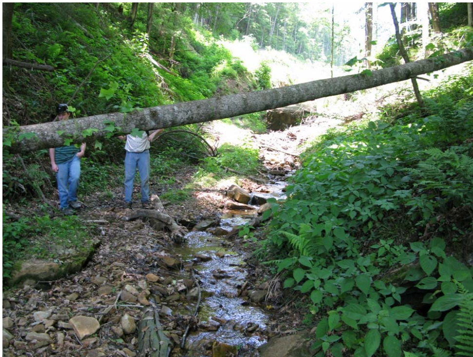
Photograph # 32: View of approximate location of sample VF-02.