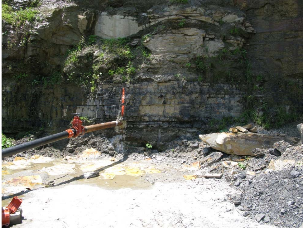
Photograph # 23: View of approximate location of sample MD-03.