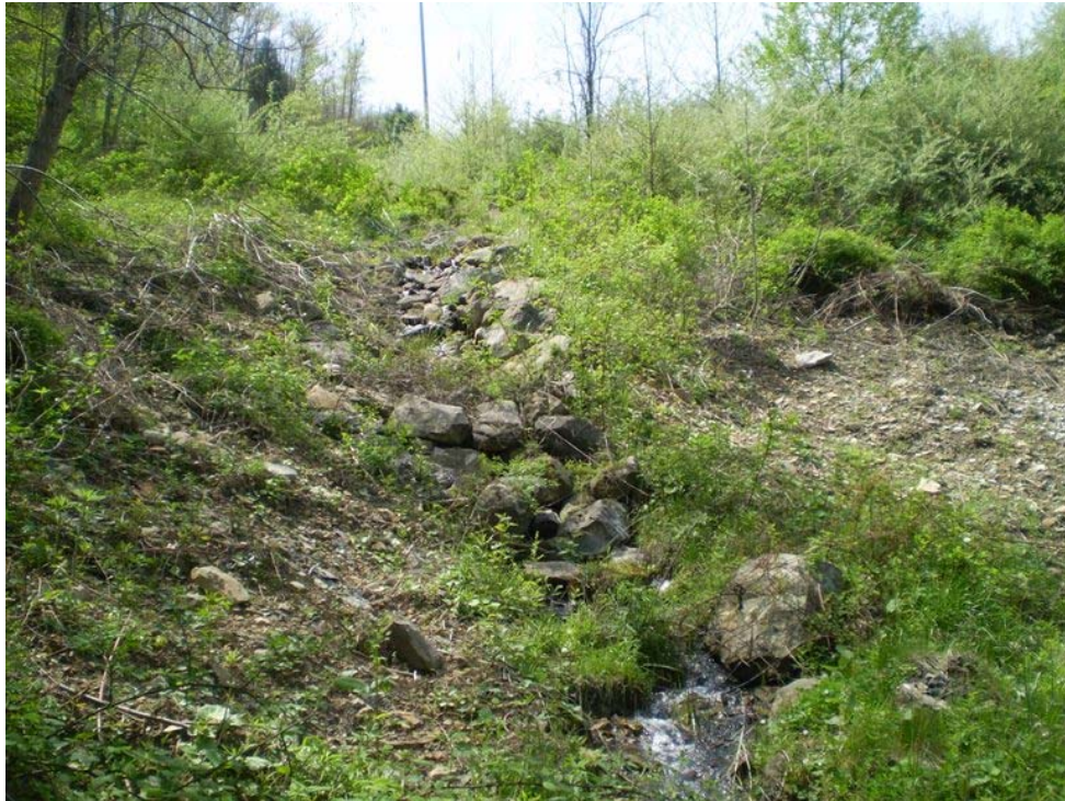
Photograph # 17: View of Right Groin a.