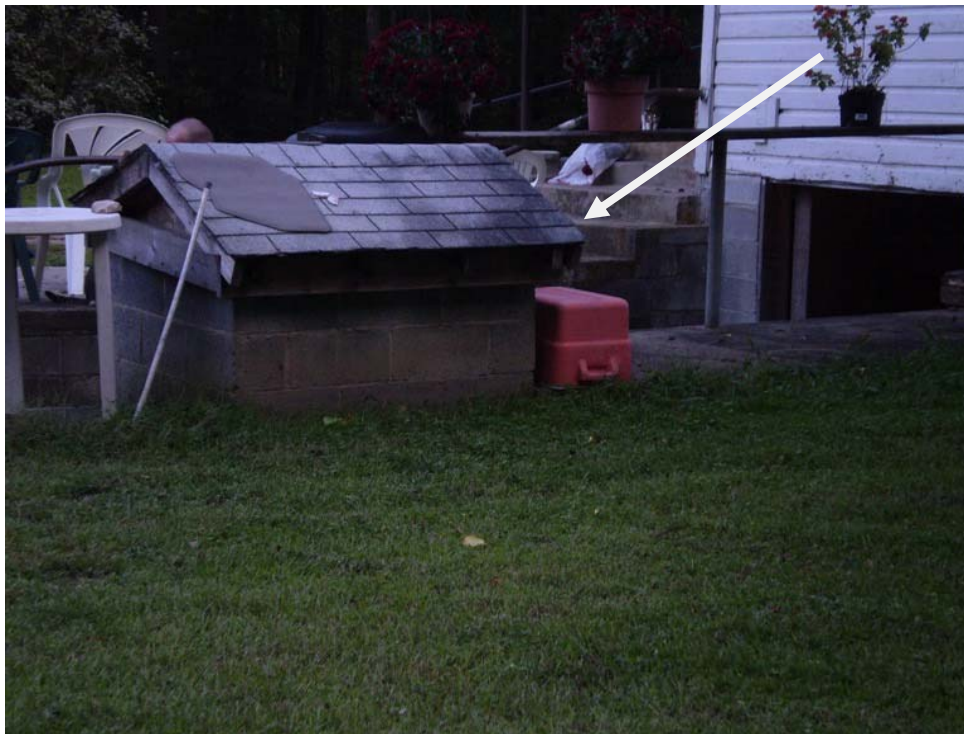
Photograph # 67: View of well house – sample DW-31.