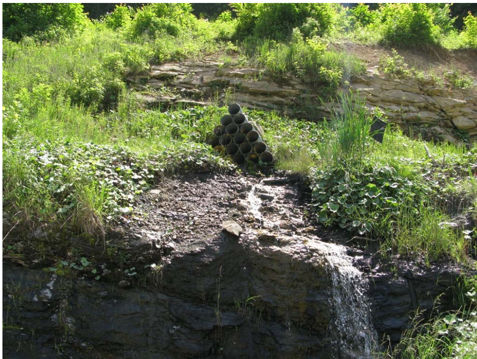
Photograph # 27: View of approximate location of sample MD-05.