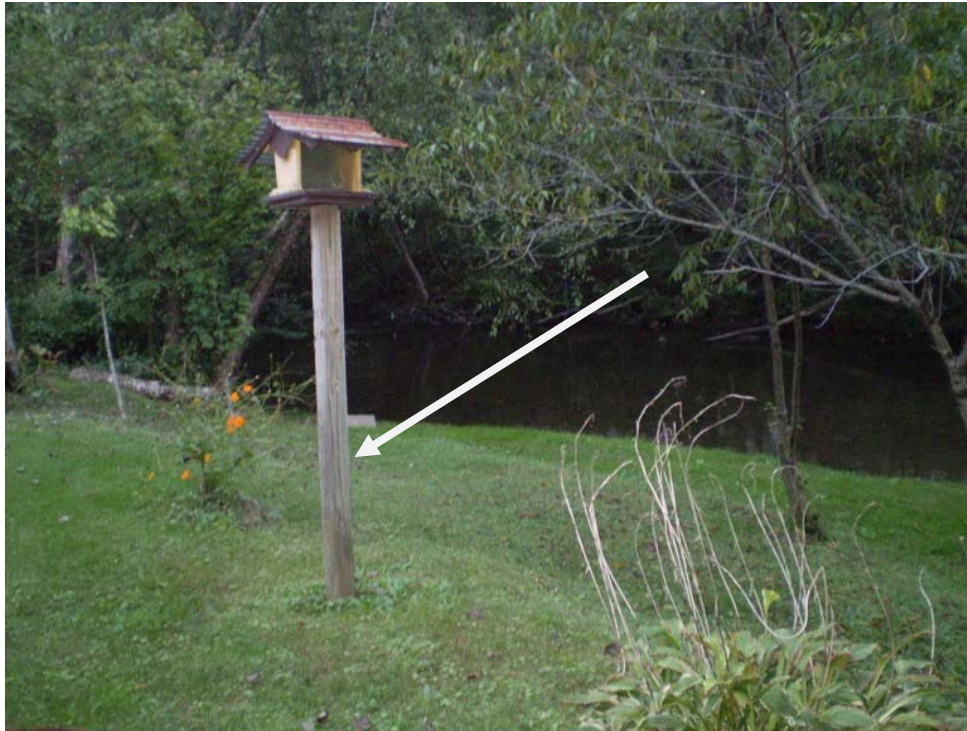
Photograph # 71: View of location of well head – sample DW-32.