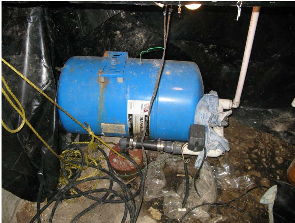
Photograph # 10: First view of pump – sample DW-3.