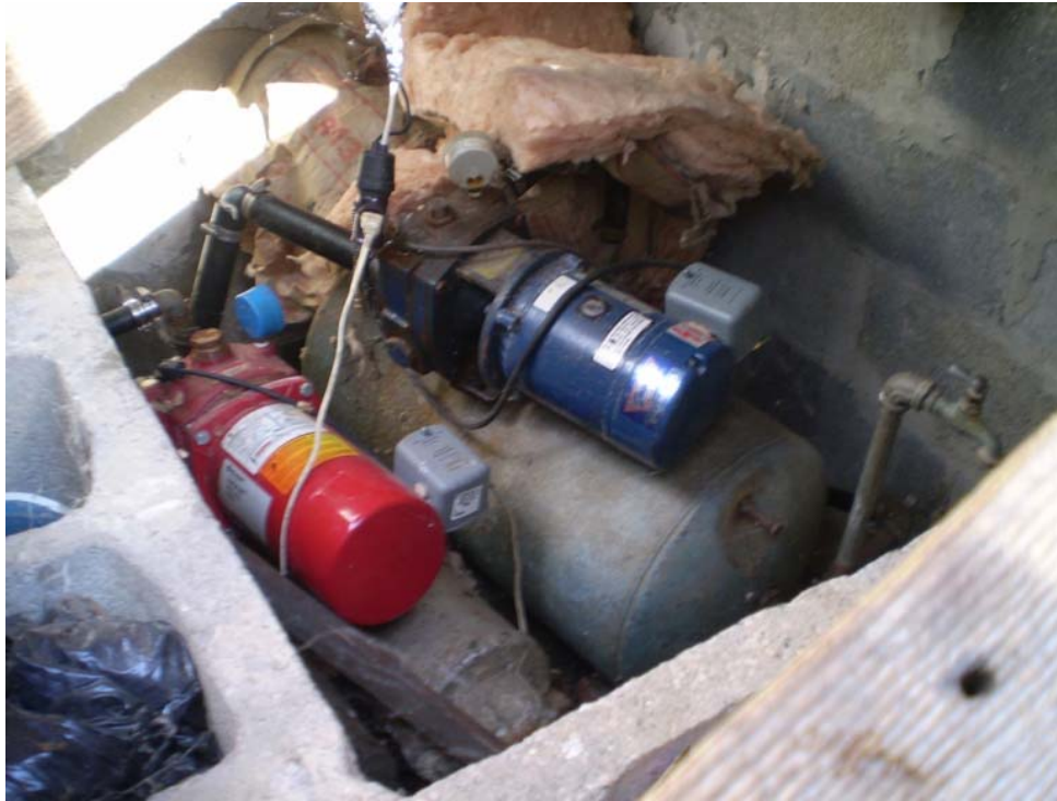
Photograph # 73: View of pump – sample DW-30.