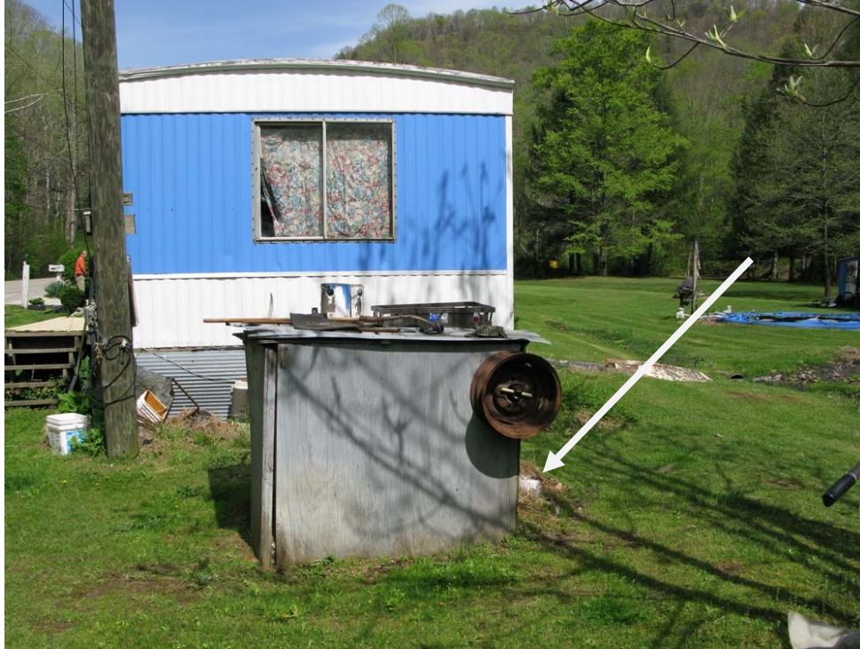
Photograph # 37: View of well house – sample DW-17.