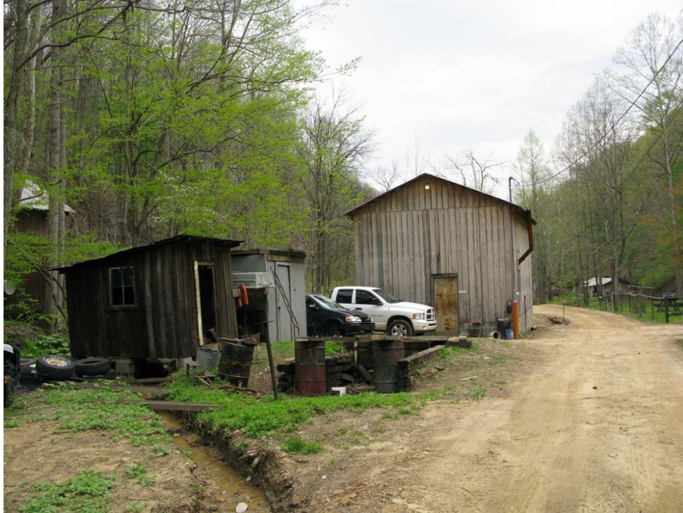
Photograph # 7: View of drums downstream of SW-6.