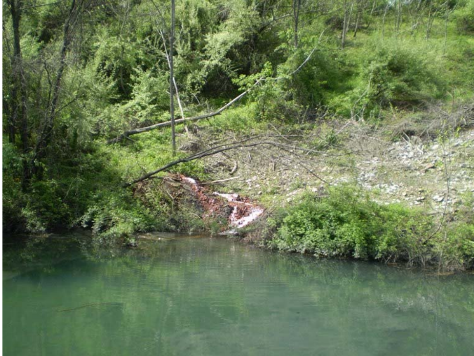
Photograph # 15: View of Lott's Fork Toe a.