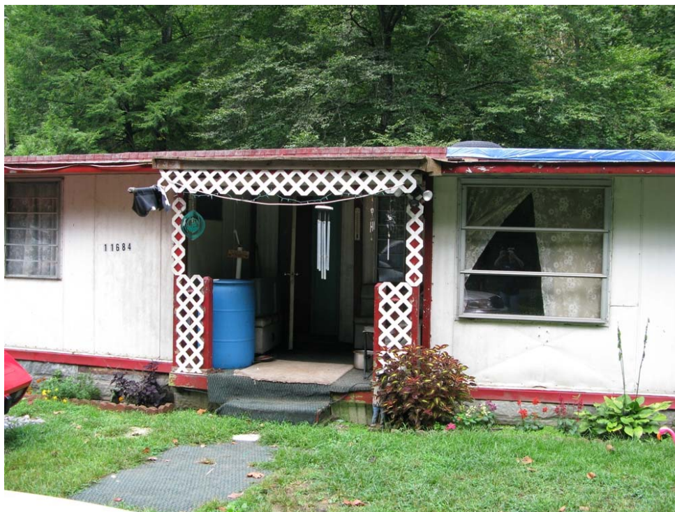
Photograph # 53: View of residence served by DW-25.