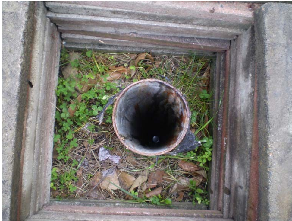
Photograph # 30: View of well casing – sample DW-12.