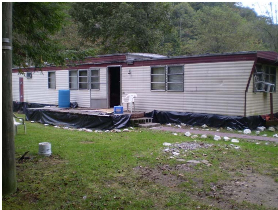
Photograph # 64: View of residence served by DW-30.