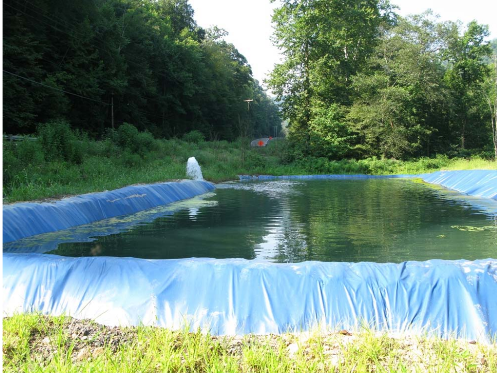
Photograph # 28: View of approximate location of sample MD-06.