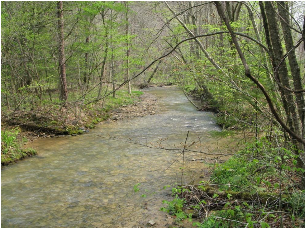
Photograph # 4: View of approximate location of sample SW-5.