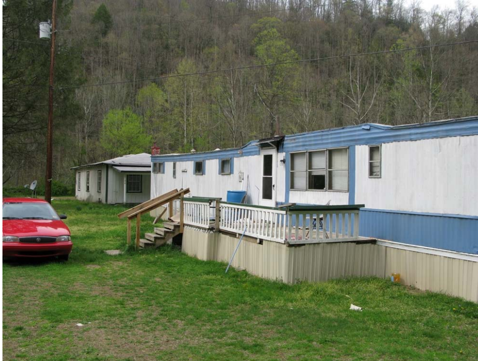
Photograph # 39: View of residence served by DW-18.