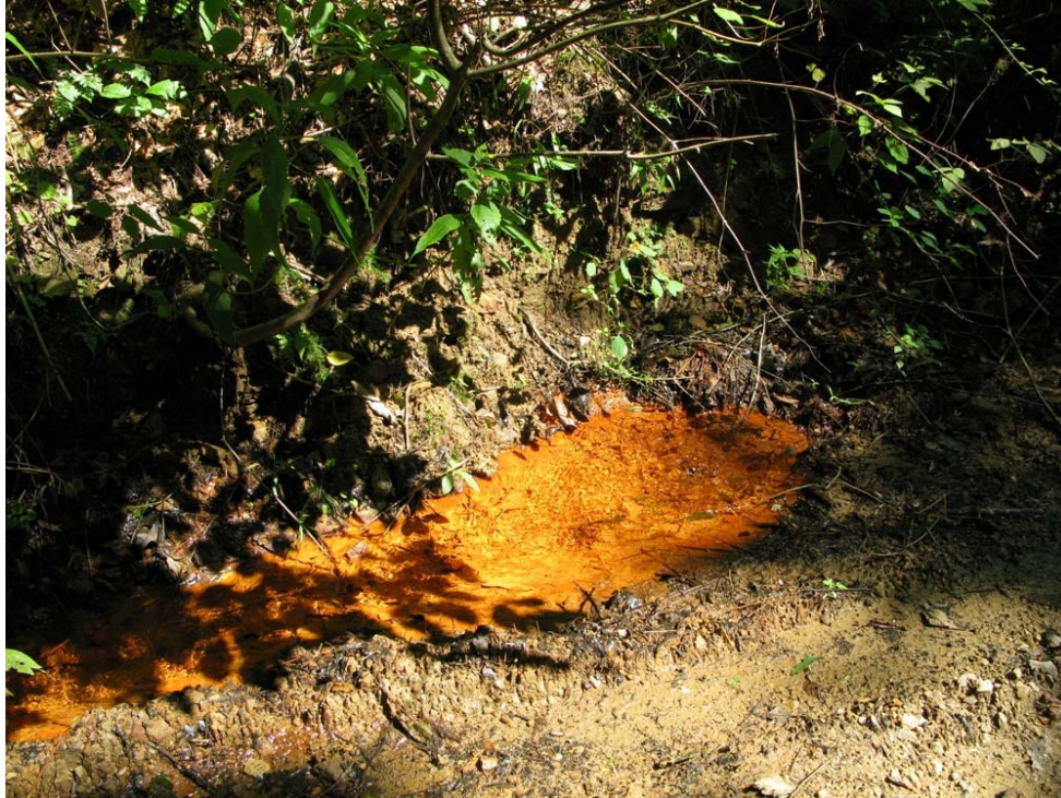
Photograph # 30: View of seep near MD-07.