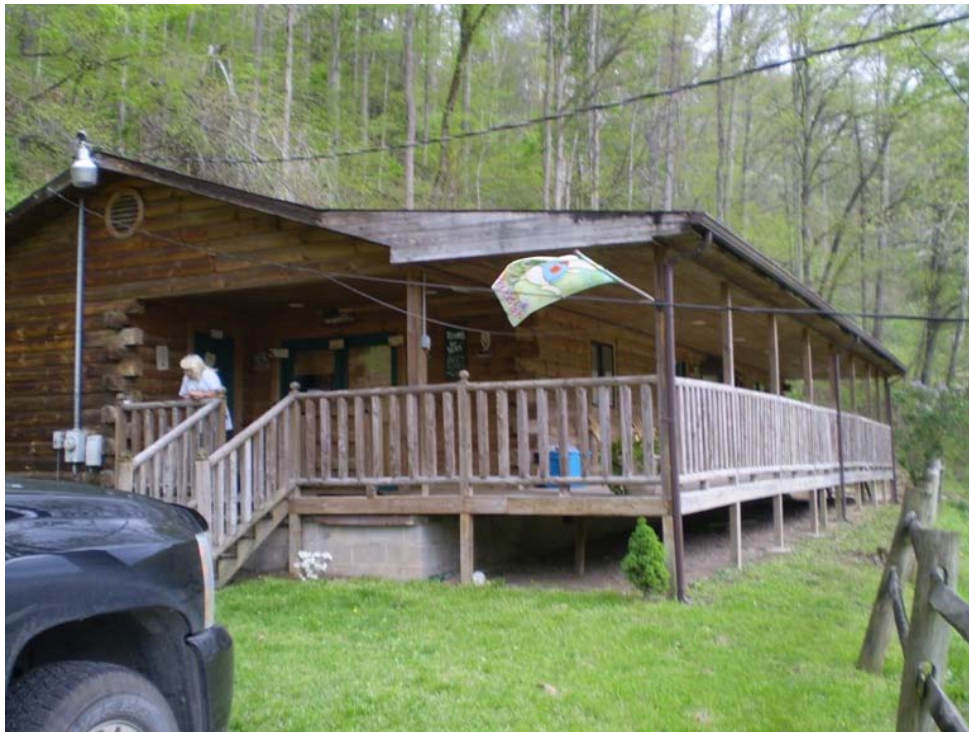
Photograph # 24: View of residence served by DW-9.