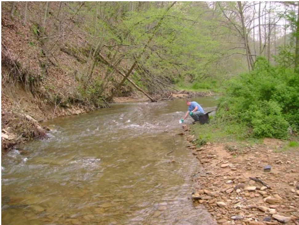
Photograph # 2: View of approximate location of sample SW-2.