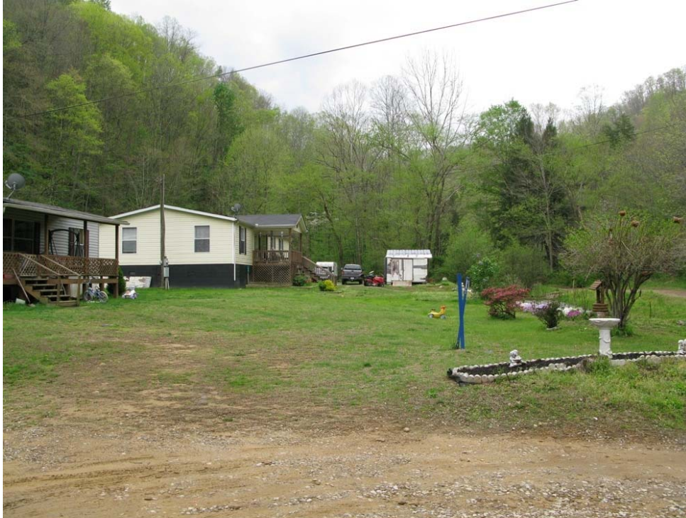
Photograph # 3: View of area from which samples DW-2, DW-3, and DW-4 were collected.