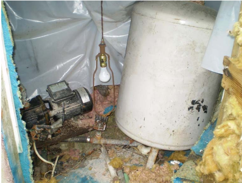
Photograph # 65: View of pump – sample DW-30.