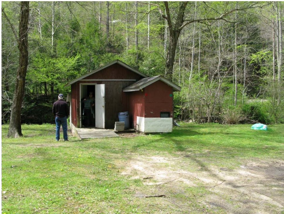
Photograph # 36: View of well house – sample DW-15.