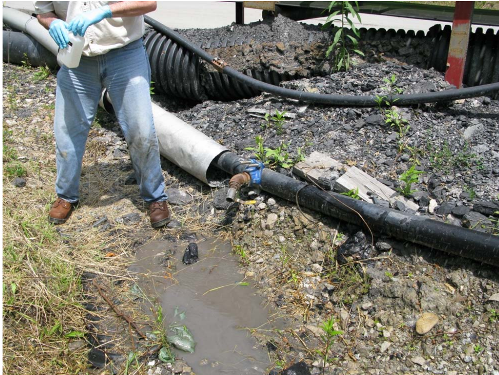
Photograph # 13: View of sample IW-01.