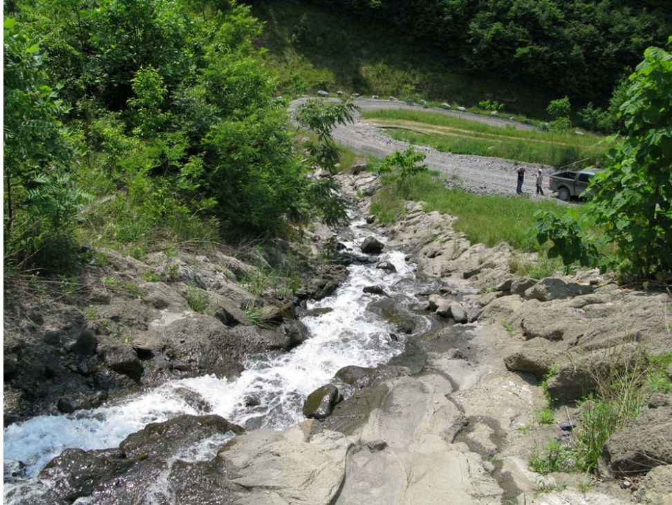
Photograph # 11: View of decant water area – sample DW-01.