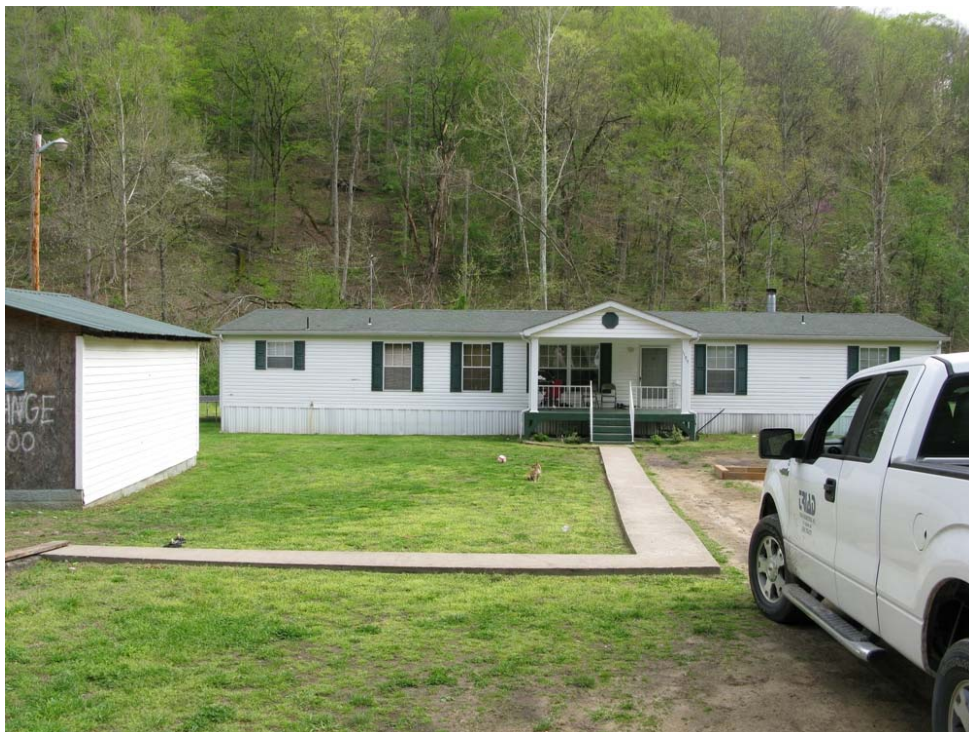
Photograph # 26: View of residence served by DW-11.