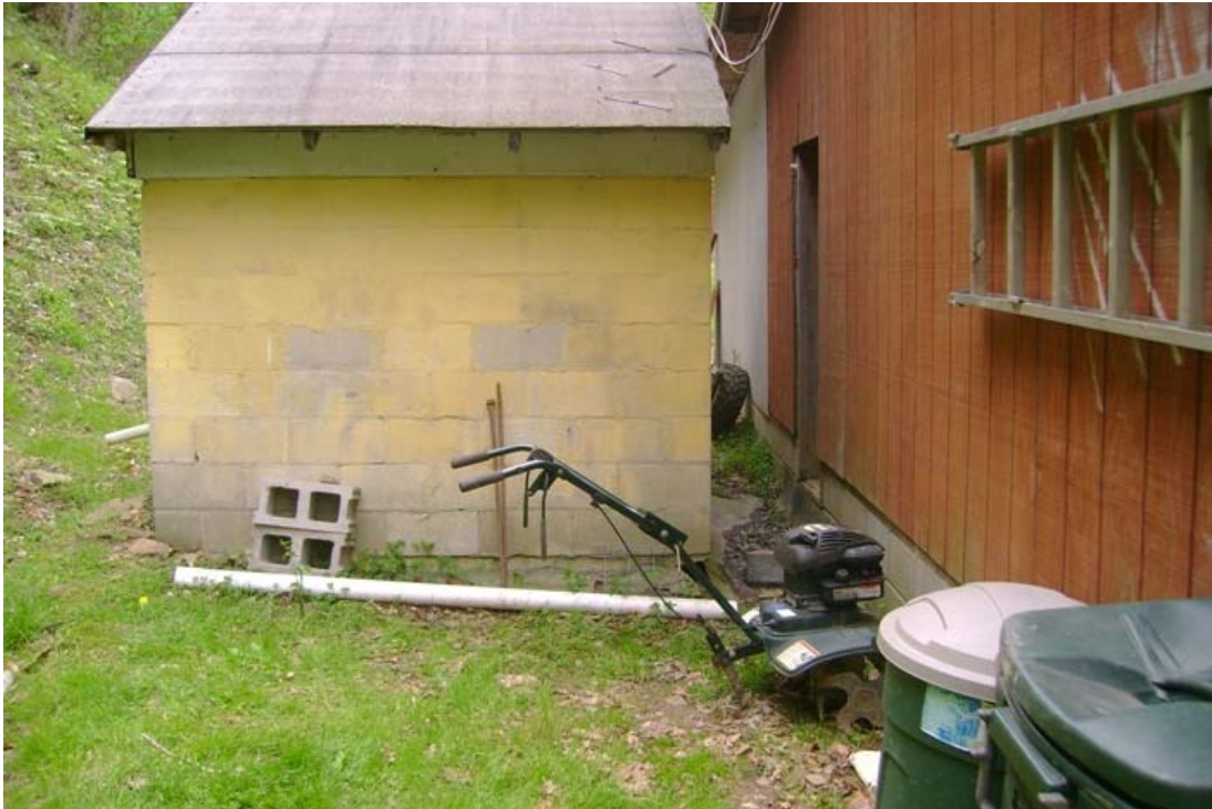
Photograph # 1: View of well house – sample DW-1.