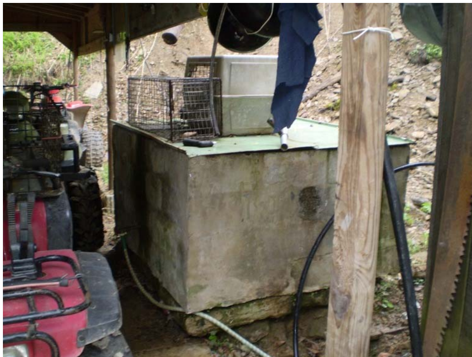
Photograph # 18: View of well house – sample DW-6.