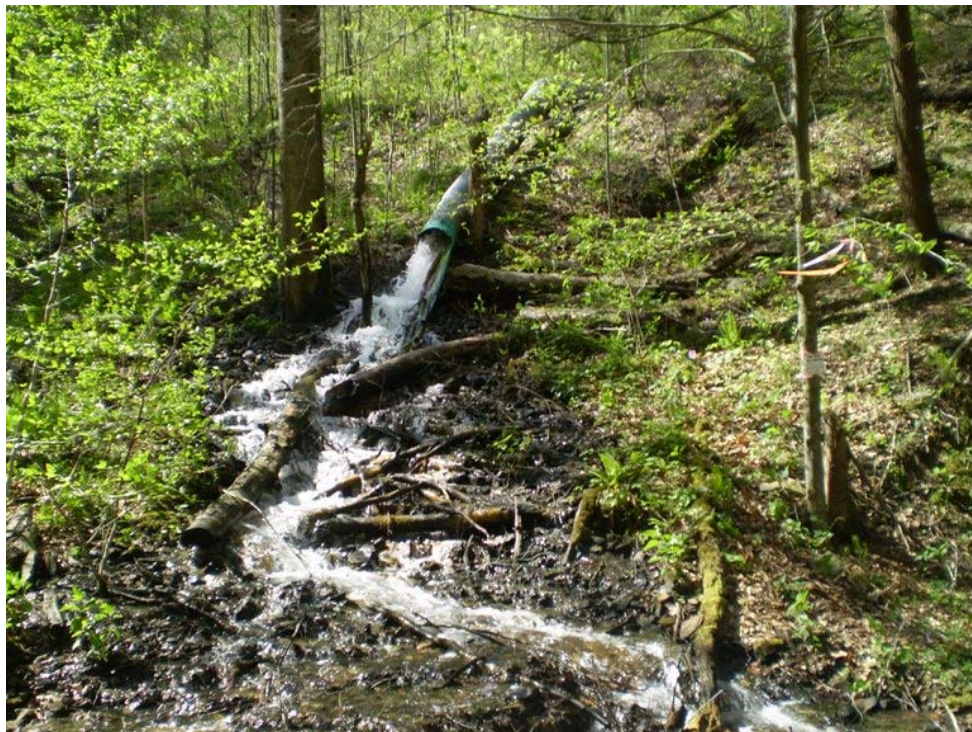
Photograph # 18: View of Outlet 20.