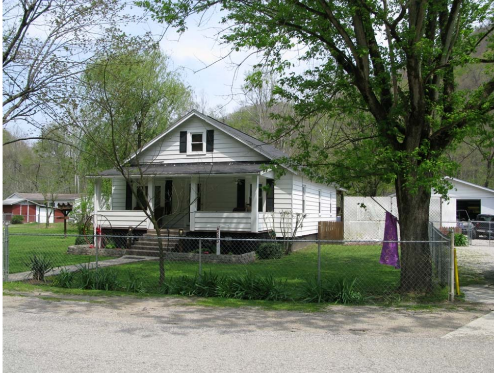
Photograph # 19: View of residence served by DW-7.