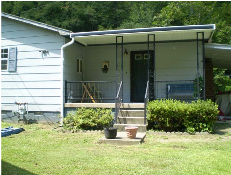
Photograph # 48: View of residence served by DW-22.