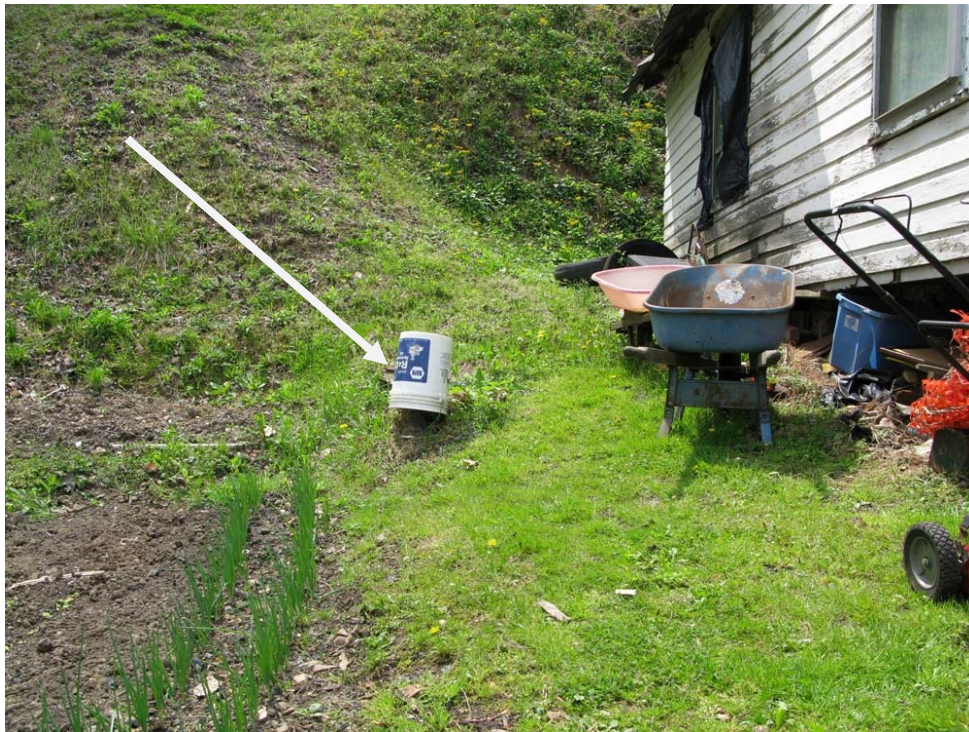
Photograph # 22: View of well head – sample DW-8.