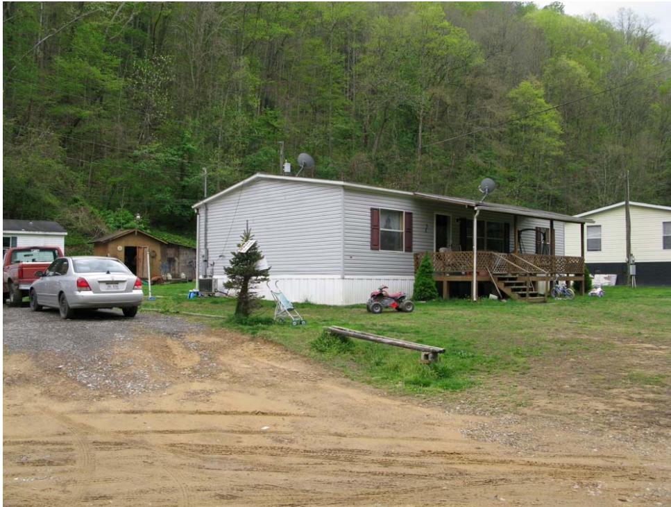
Photograph # 7: View of residence served by DW-3.