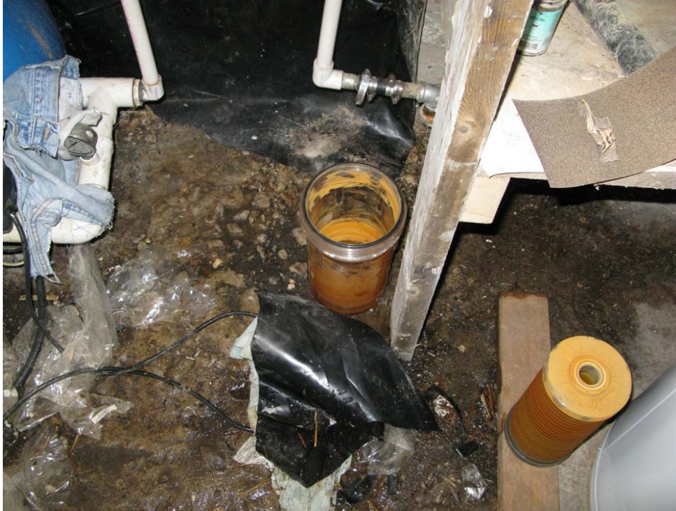
Photograph # 11 Second view of pump – sample DW-3.