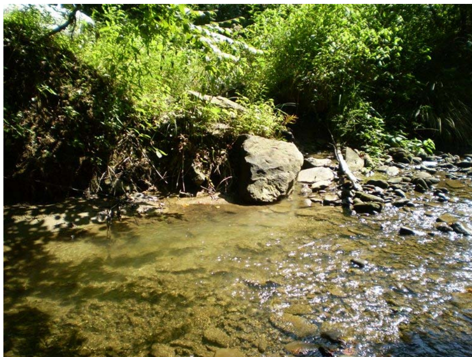
Photograph # 10: View of approximate location of sample SW-8.