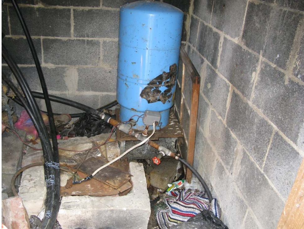
Photograph # 23: View of pump house – sample DW-8.