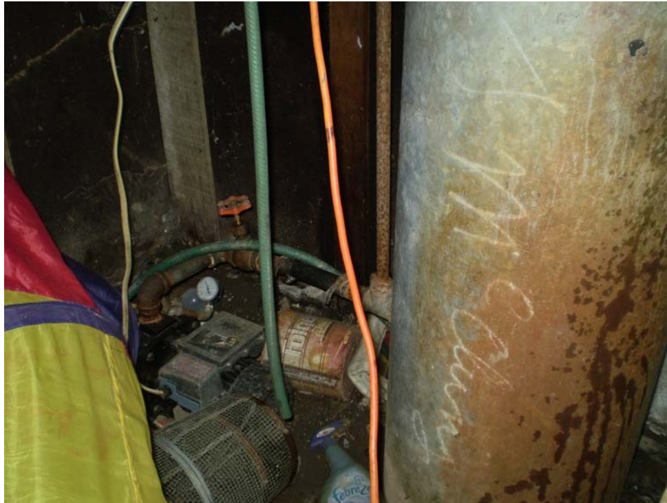
Photograph # 17: View of pump – sample DW-5.