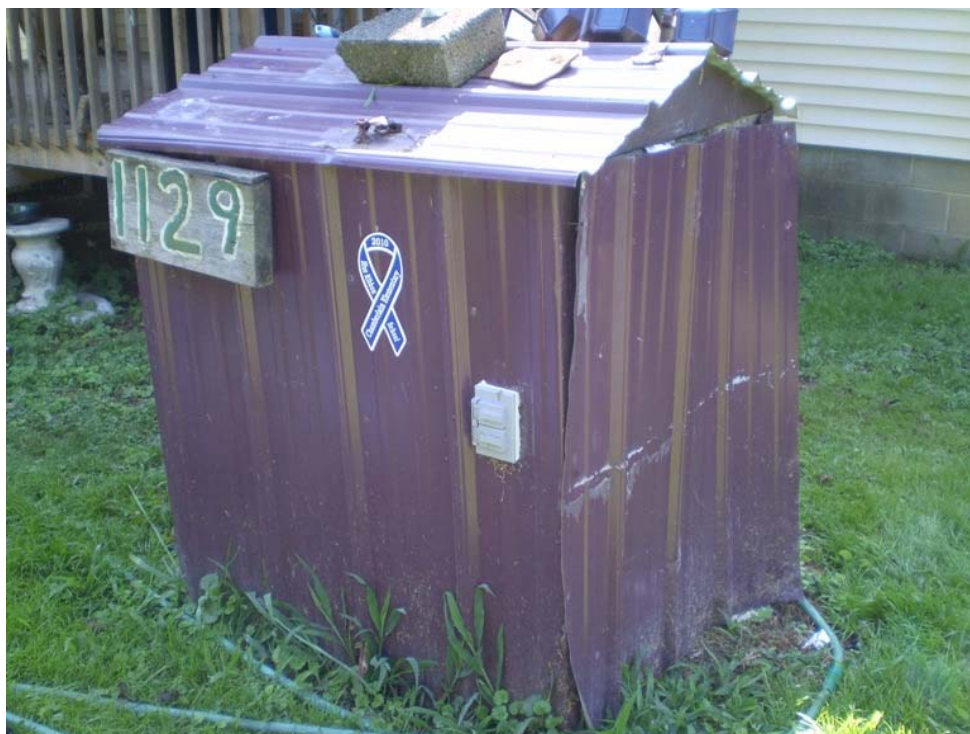
Photograph # 32: View of well house – sample DW-13.