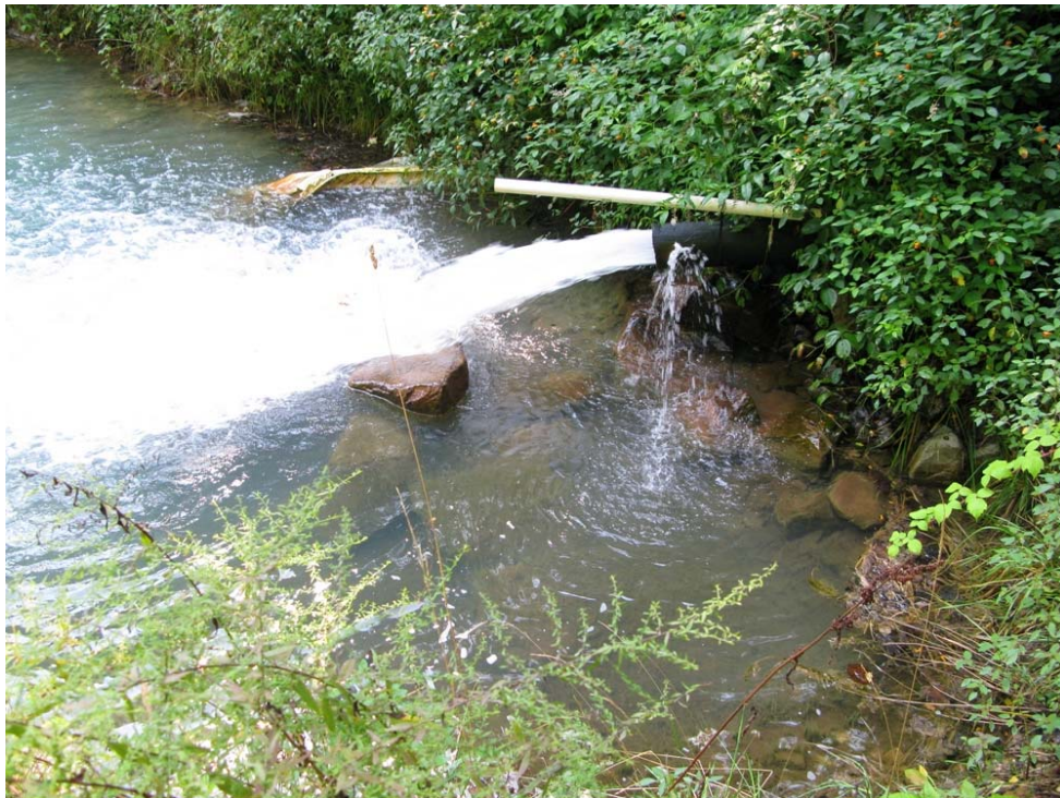
Photograph # 29: View of approximate location of sample MD-07.