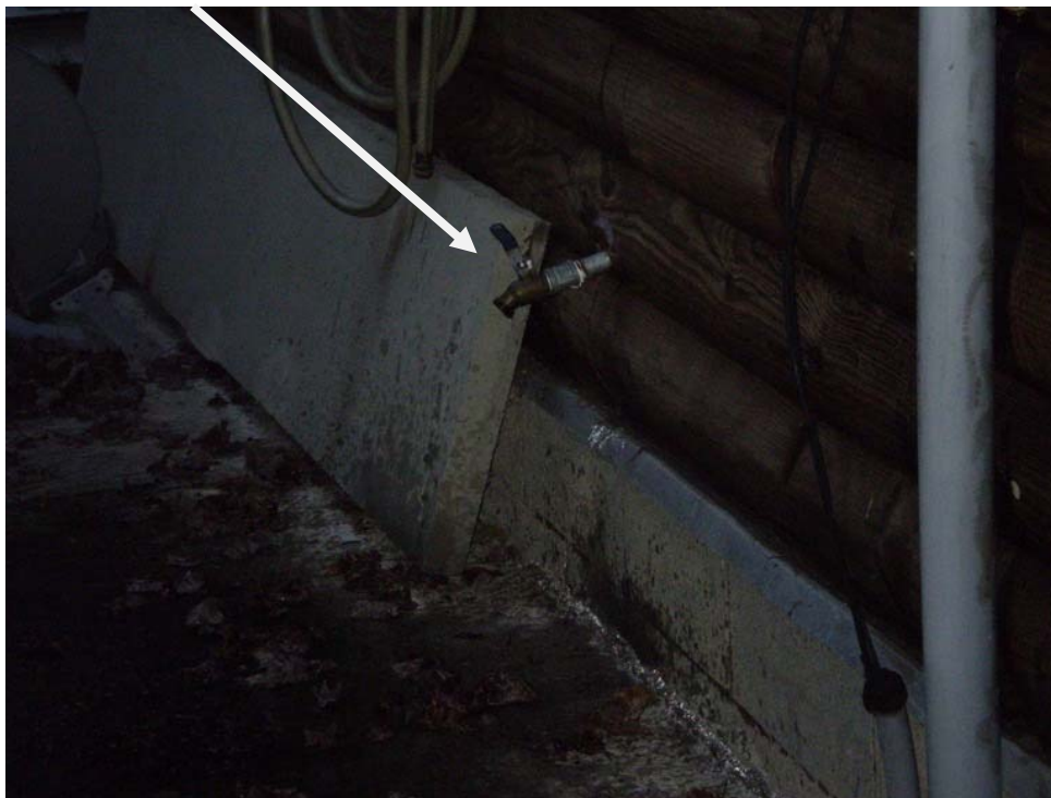
Photograph # 68: View of hose bib – sample DW-31.