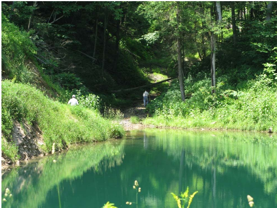
Photograph # 31: View of approximate location of sample VF-01.