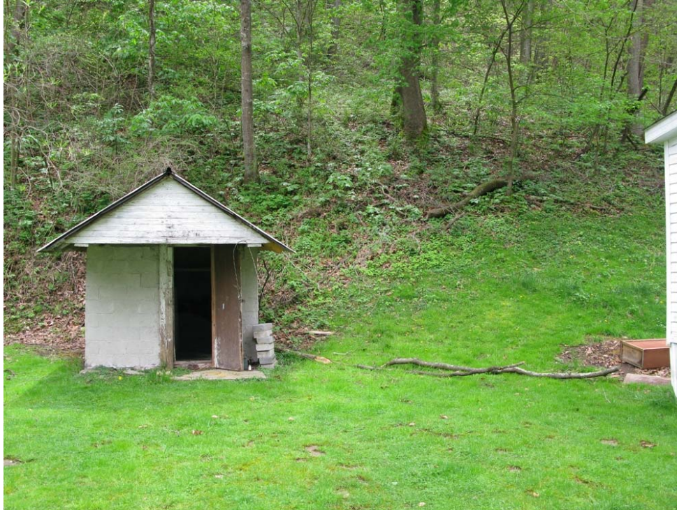
Photograph # 9: View of pump house – sample DW-3.