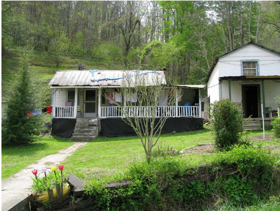
Photograph # 21: View of residence served by DW-8.