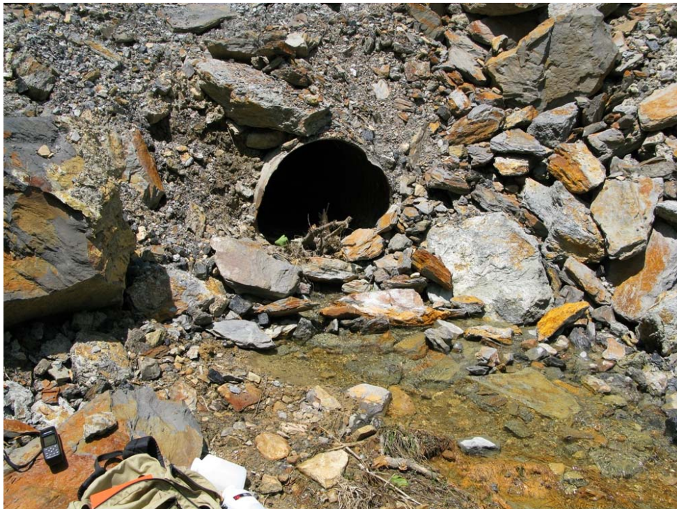
Photograph # 22: Second view of location of MD-02.