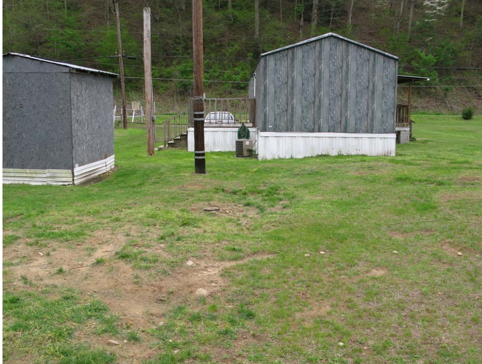
Photograph # 47: View of septic area – sample DW-20.