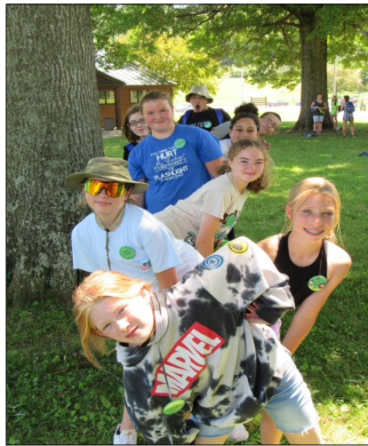
Participants at state Junior Conservation Camp, Cedar Lakes in Ripley.

Kids are busier these days, no question. We are competing against other camps, school