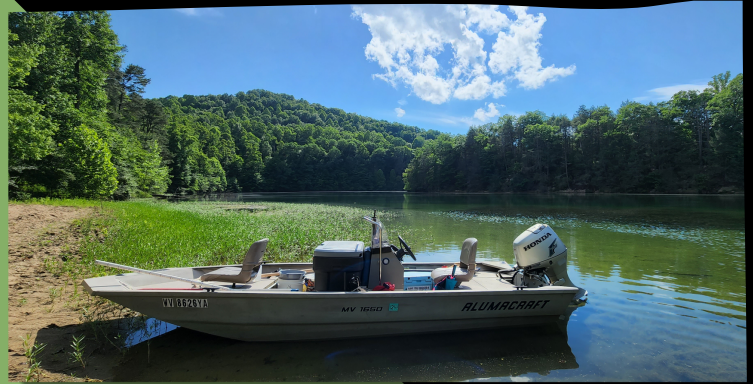
Boatable Lake Assessment