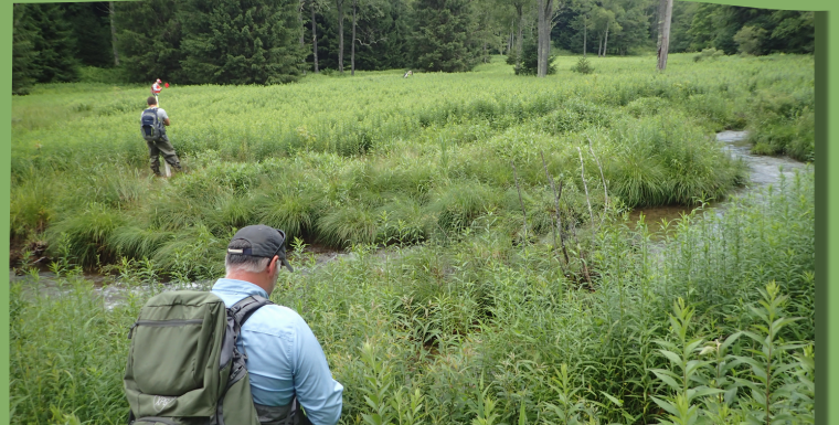
Wetland Habitat Assessment