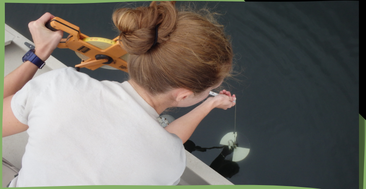
Evaluating Water Column Turbidity