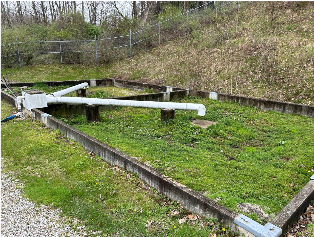
4/10/2024 - IMG_3914 The sand filter beds were covered in vegetation at Franklin Manor.