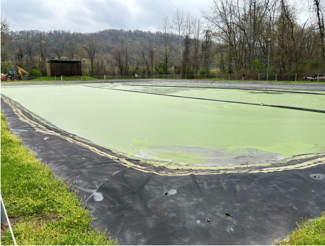
4/10/2024 - IMG_3888 The lagoon was covered in duckweed at Beech Bottom.