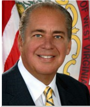
Message from Gov. Earl Ray Tomblin

Among the hundreds of pieces of legislation that passed and that I signed into law this year, this bill truly puts the needs of