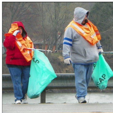
Volunteers braved all types of weather to participate in the Make It Shine Cleanup. The St. Albans High Quarterback Club cleaned a stretch of Route 60 on a chilly day.