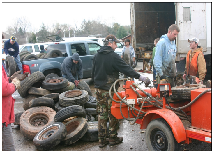
One of this spring's first tire collections netted 3,800 tires in Putnam County. At least one tire collection is scheduled for each county.