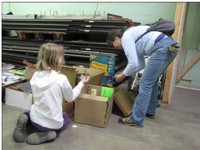
Visitors to the ZeroLandfill event, sponsored in part by the DEP, sift through materials at the Habitat for Humanity ReStore.

He also serves on two councils — the West Virginia Water Gauging Council and the West Virginia State University Research Advisory Council.