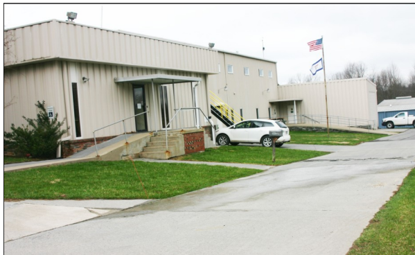
What once housed a rebuild shop, now serves as the DEP's Oak Hill office. Close to 100 employees work out of the facility.

And considering it was once used for storage, the roughly 4,500-