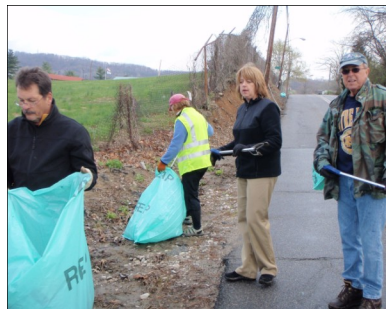
Members of the Kanawha Ski Club picked up litter around Shawnee Park in Institute as part of the Make It Shine Program.