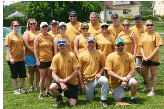
The softball team set the tone for Cup competition.