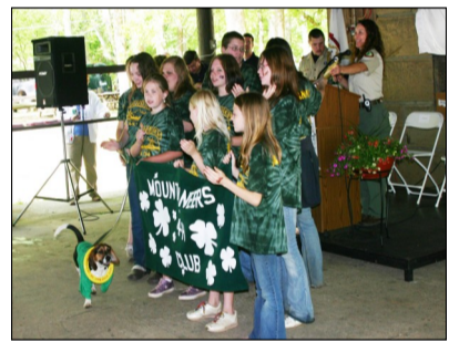
Left, recent Youth Environmental Conference attendees enjoy a day of zip-lining. Right, a Youth Day group shares a cheer with the crowd at North Bend State Park.

companies, and corporations that provide the award contributions attend to personally present the awards they have made available to the most outstanding winners."