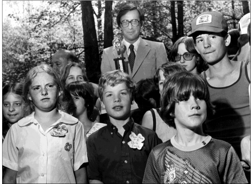
Then-W.Va. Gov. Jay Rockefeller made a stop at Youth Environmental Day.

"Representatives from businesses, organizations,