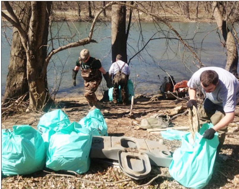
Top, Ducks Unlimited members tackle trash in Jefferson County during a Make It Shine cleanup. Right, Girl Scouts from troops 40027 and 40063 work on a cleanup in Mineral County. A record number of volunteers, more than 5,000, turned out for this spring's cleanup efforts across West Virginia.