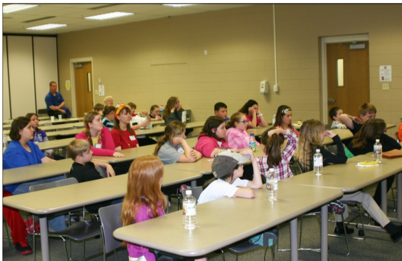
Thirty-one youngsters took part in Take Our Daughters and Sons to Work Day on April 25 at DEP headquarters, where a morning of activities was planned.