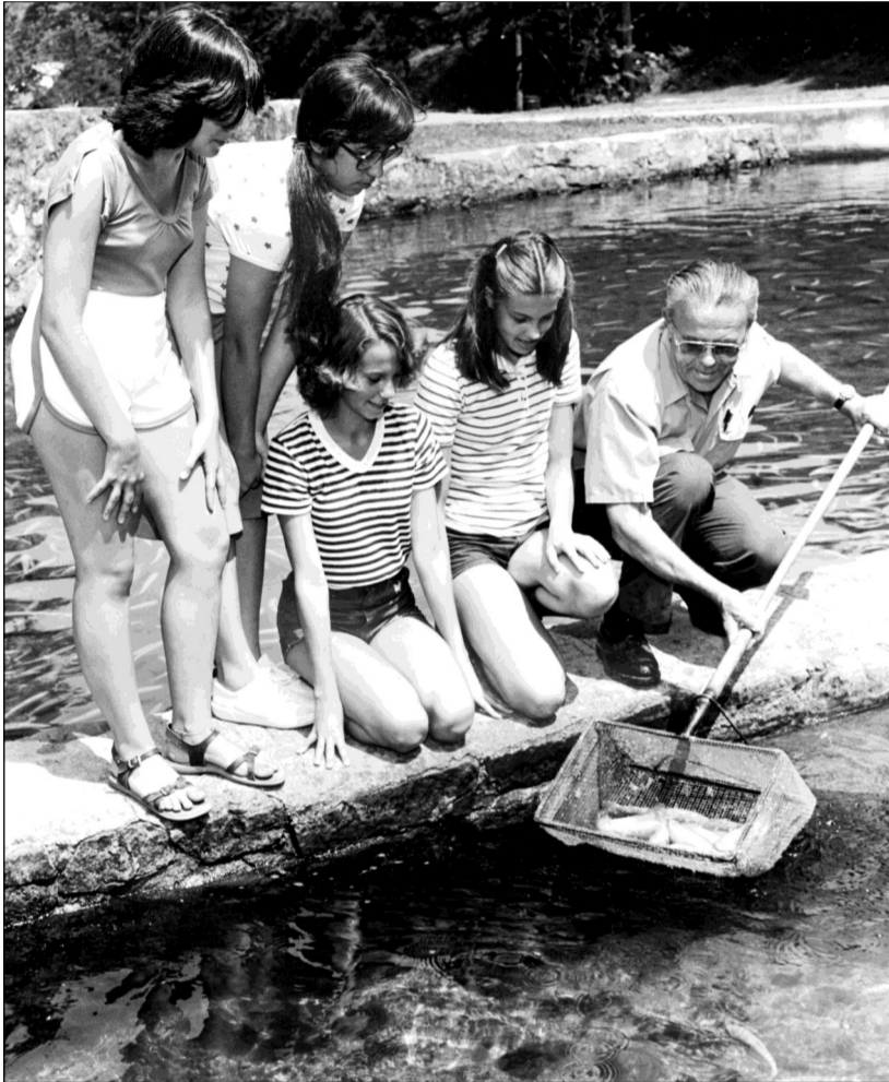
Learning has always been an integral part of the Youth Environmental Program.