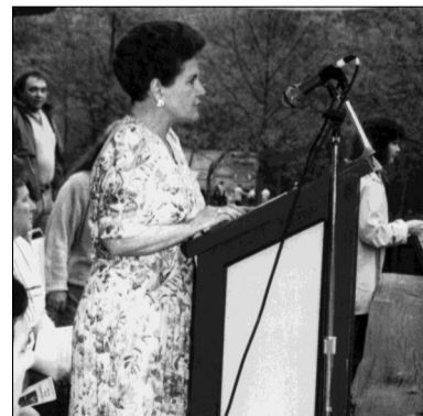
The late Maxine Scarbro founded the Youth Environmental Program in 1963 under the then state Department of Natural Resources.

The YEP's 2013 Junior Conservation camp, open to campers ages 11-14, is scheduled