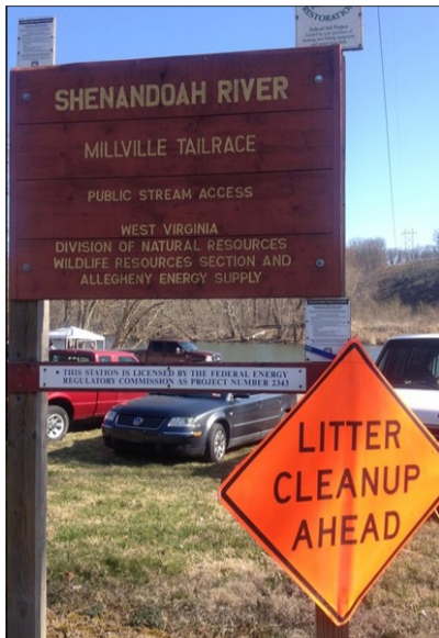
This state waterway benefitted from volunteer cleanup efforts as part of the DEP's Make It Shine Program. Below, Girl Scouts in Mineral County show their cleanup spirit.