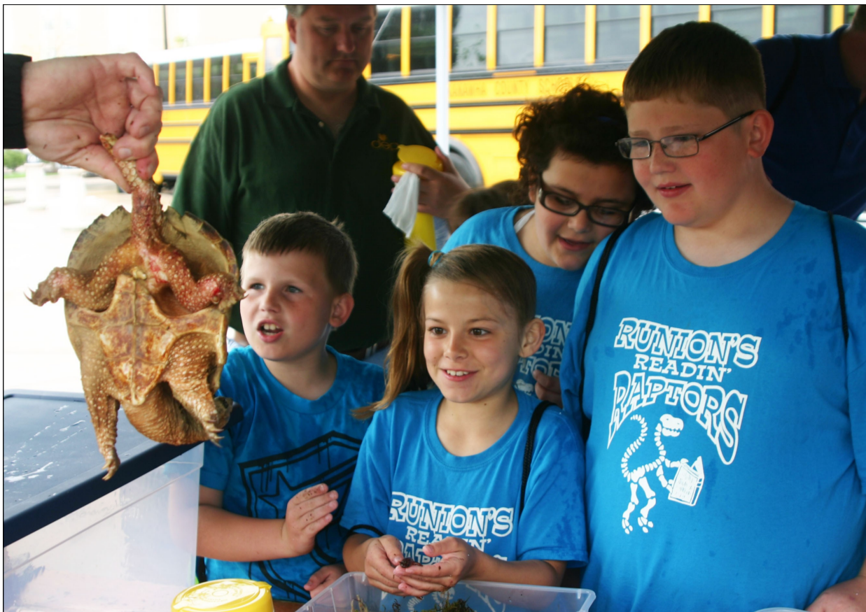
Kids visiting the DEP Watershed Assessment Branch's Earth Day tent get to look at, but not touch, this snapping turtle.