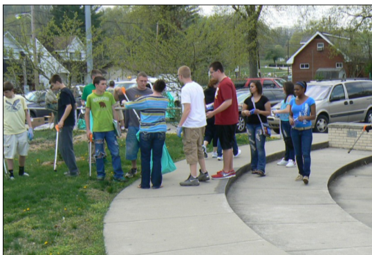
Students at St. Albans High get ready for a cleanup.