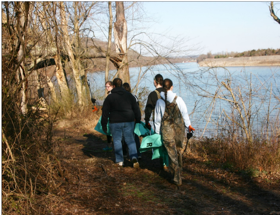
These Winfield High students spent part of their spring break on a Make It Shine cleanup.