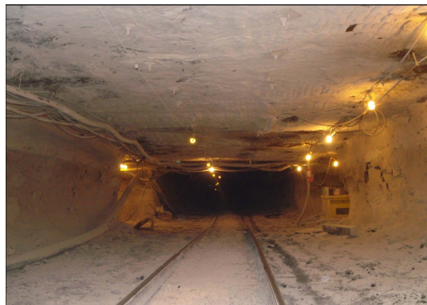
The mantrip ride from the shaft elevator to the face of the longwall operation took close to an hour on these tracks.

I experienced something that very few people, who are not coal miners, get to experi-