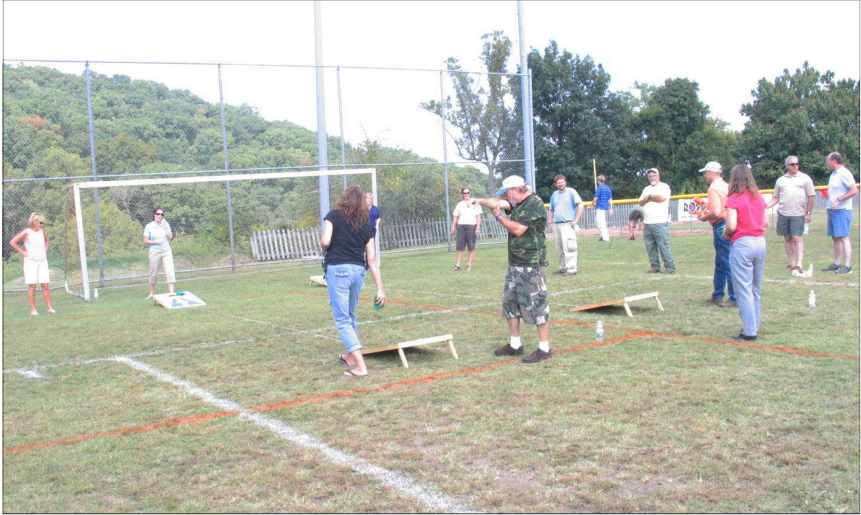
Cornhole competition was popular during the Employee Recognition Event at Little Creek Park in South Charleston.