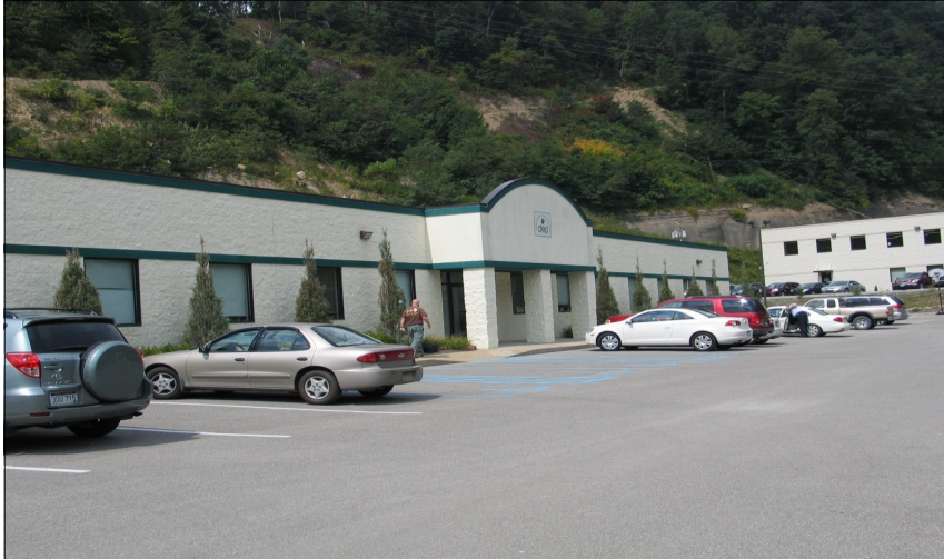
The DEP's Division of Mining and Reclamation office in Logan employs about 60 people when fully staffed. The 5-year-old building has 13,000 square feet of space.