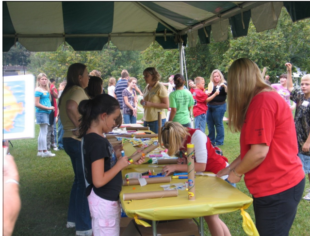
Students make and decorate rain sticks with the help of DEP employees during the Children's Water Festival.