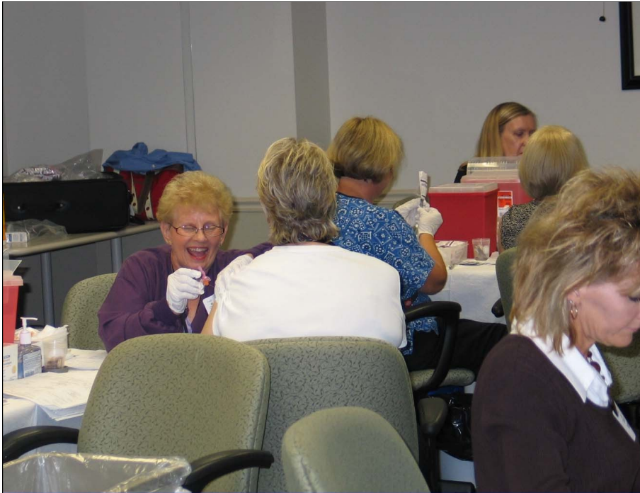
DEP employees lined up for seasonal flu shots offered at the agency headquarters in September. The vaccine, however, does not protect people from the H1N1 virus, or swine flu.