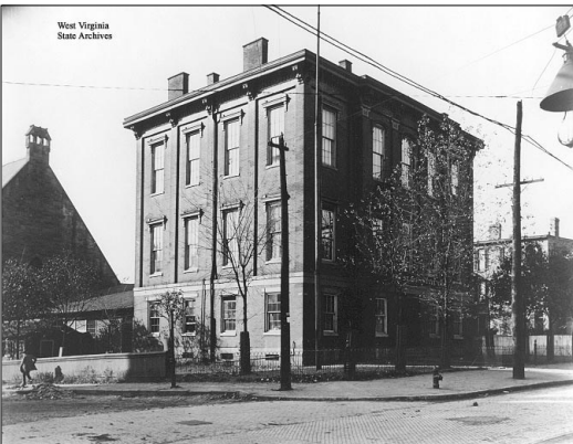
West Virginia's first state Capitol, as it appeared in the late 19th Century.

"If you could time travel, you would go back and find that people were doing this kind of thing already. Look at the homes and buildings, they were using passive solar efficiency - putting deciduous trees on the south side where the sun shined. So using solar power for electricity is really the next step from what people have been doing for centuries."