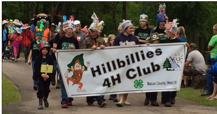
Despite pesky rain clouds, the recycled hat parade went on as scheduled. Here, members of the Hillbillies 4H Club of Mason County show off their creations.

The answers to the scavenger hunt were found in the numerous exhibits on display from various environmental agencies such as the Division of Natural Resources, the Division of Forestry and the DEP's own Division of Air