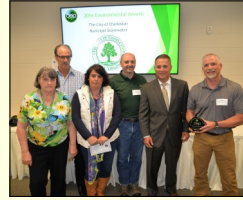
The city of Charleston Municipal Stormwater