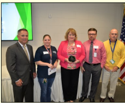
Highland Hospital Water Conservation