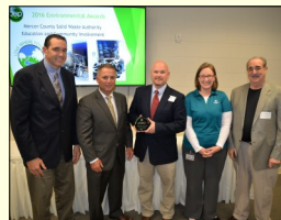
Mercer County SWA Education and Community Involvement