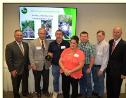
Buffalo Creek Watershed Assoc. Cabinet Secretary Award