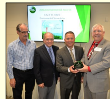
The city of St. Albans Environmental Stewardship