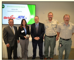
Orbital ATK Improvement to Air Quality