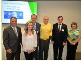
The city of Fairmont Municipal Stormwater