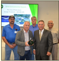
The city of Parkersburg Sewage Treatment > 400,000 GPD