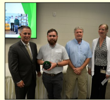
Guyandotte River Trail Environmental Partnership