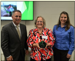
Jefferson County Commission Landuse Development