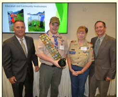
Boy Scout Troop 99 Education and Community Involvement