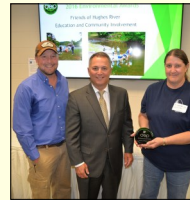
Friends of Hughes River Education and Community Involvement