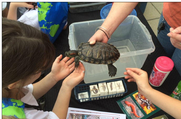
Students got a hands-on experience at the DEP's Make It Shine Earth Day celebration at the Clay Center on April 21. The students could hold turtles, salamanders, pet snakes, and see the fish of West Virginia up close - all while learning how they interact with each other in a delicate ecosystem.

Students could learn from the DEP's Watershed Improvement Branch, Watershed Assessment Branch, Rehabilitation Environmental Action Plan, the Division of Air Quality, and the Homeland Security and