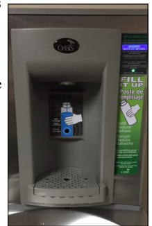
Reduce, reuse, refresh: The water bottle filling station is located near the first floor mail room.

The machine also has an electronic counter, to display the number of plastic bottles that have been evaded by using refillable containers instead. Plastic bottles fill up our landfills, litter our landscape and take approximately 1,000 years to degrade.