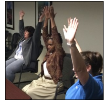
Simple stretching exercises can help to alleviate stress during the work day.

More information about stress management can be found online at www.peiaphathways.com .