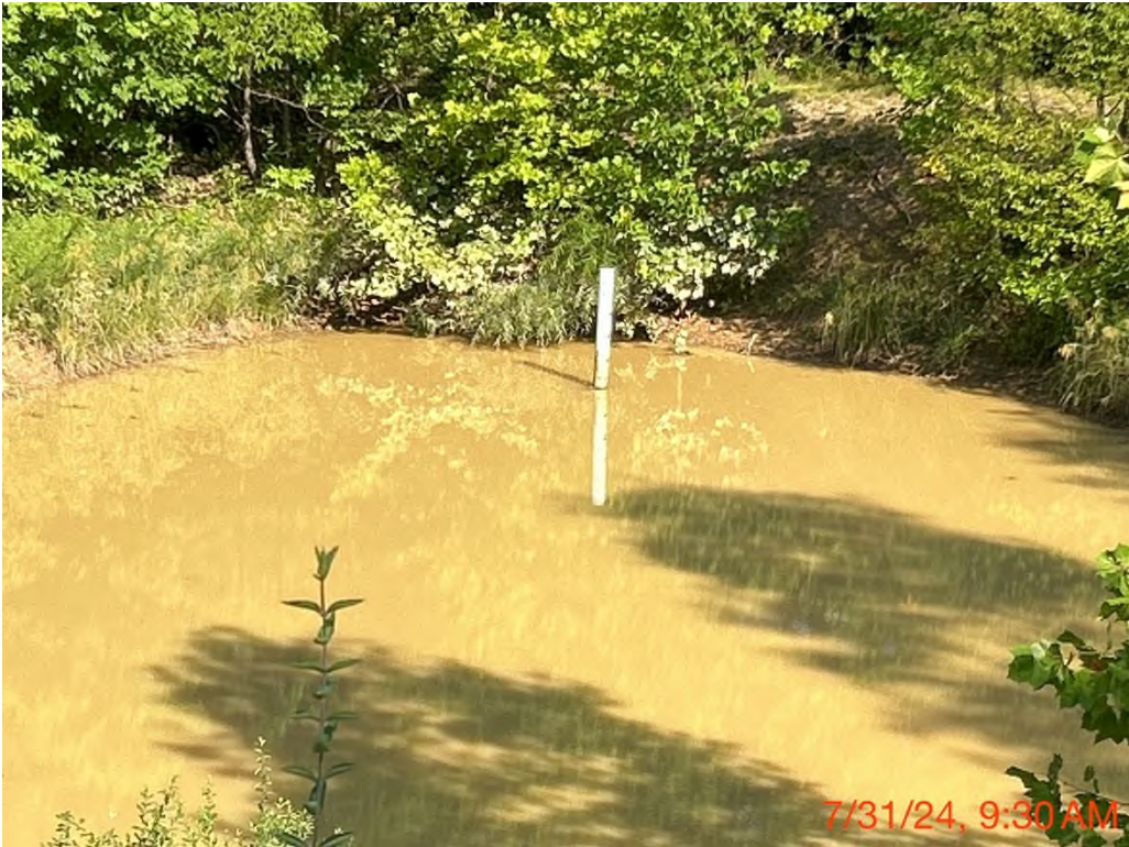
Solids in pond on the southwest side of the property