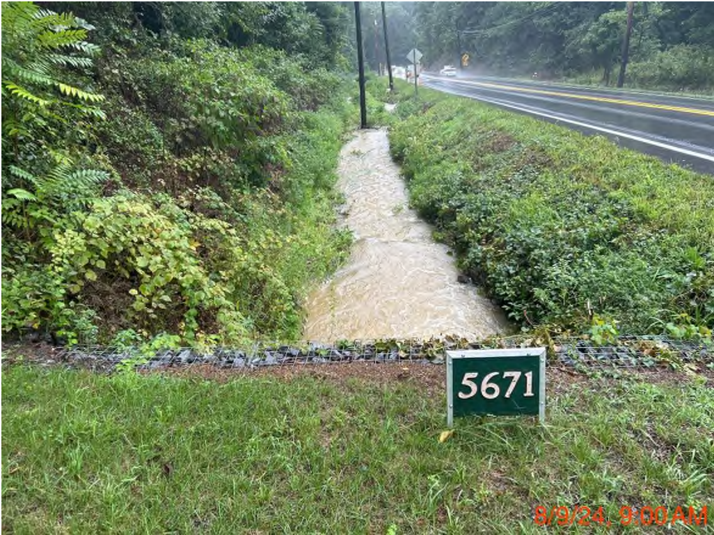
Downstream of outlet 004.