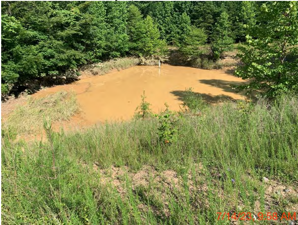
Muddy water with staining over the bank and outlet pipe.