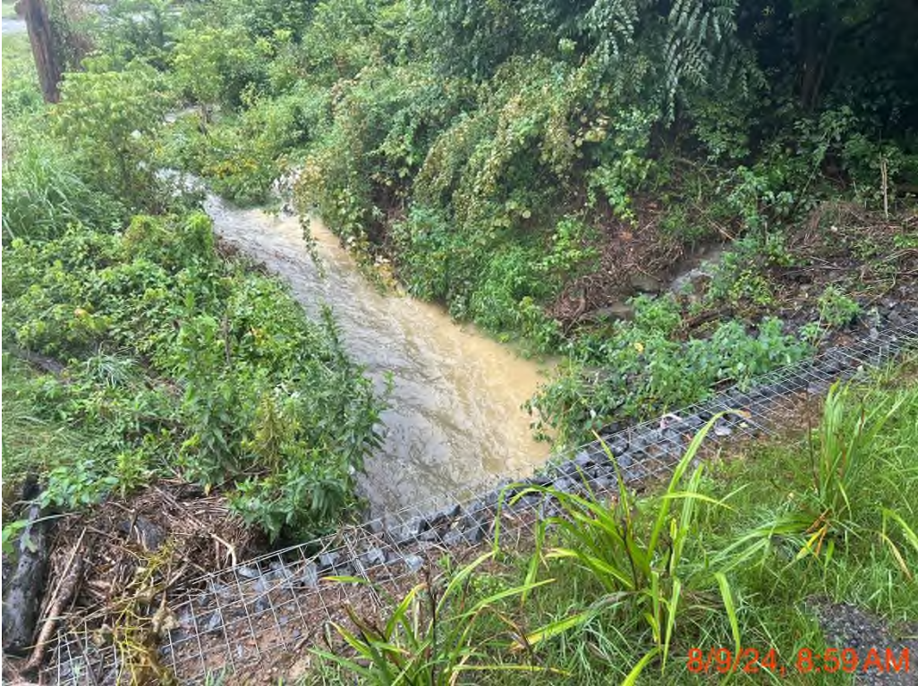
Solids from Outlet 004 comingling with clear stream water