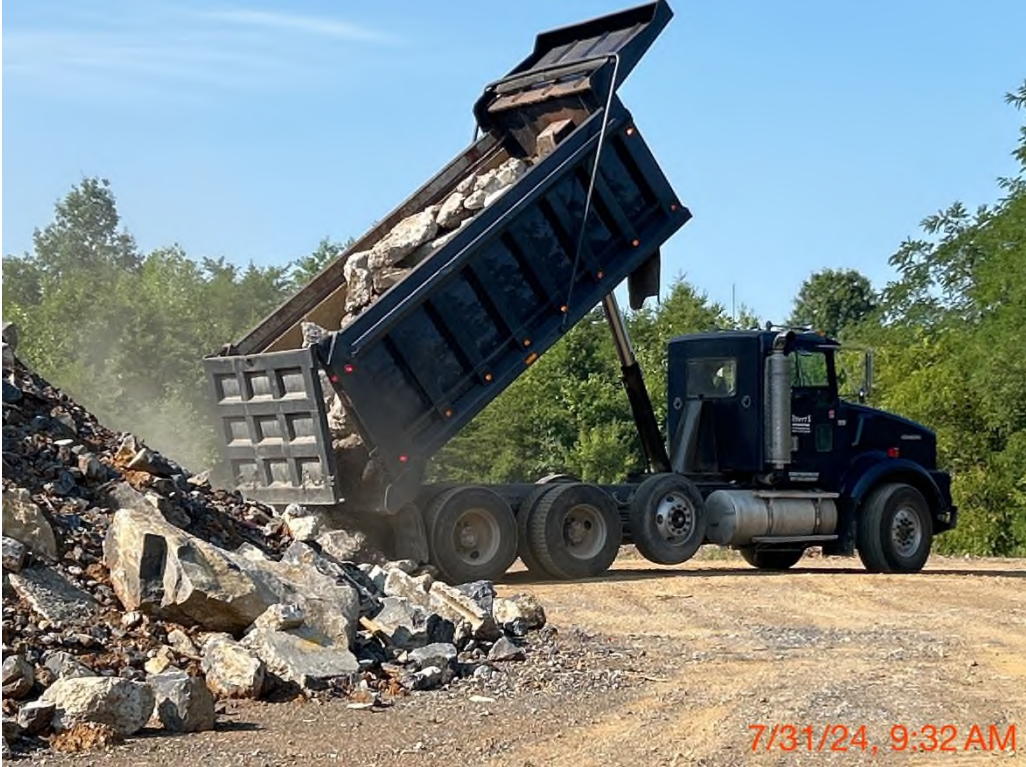
Dumping concrete with rebar