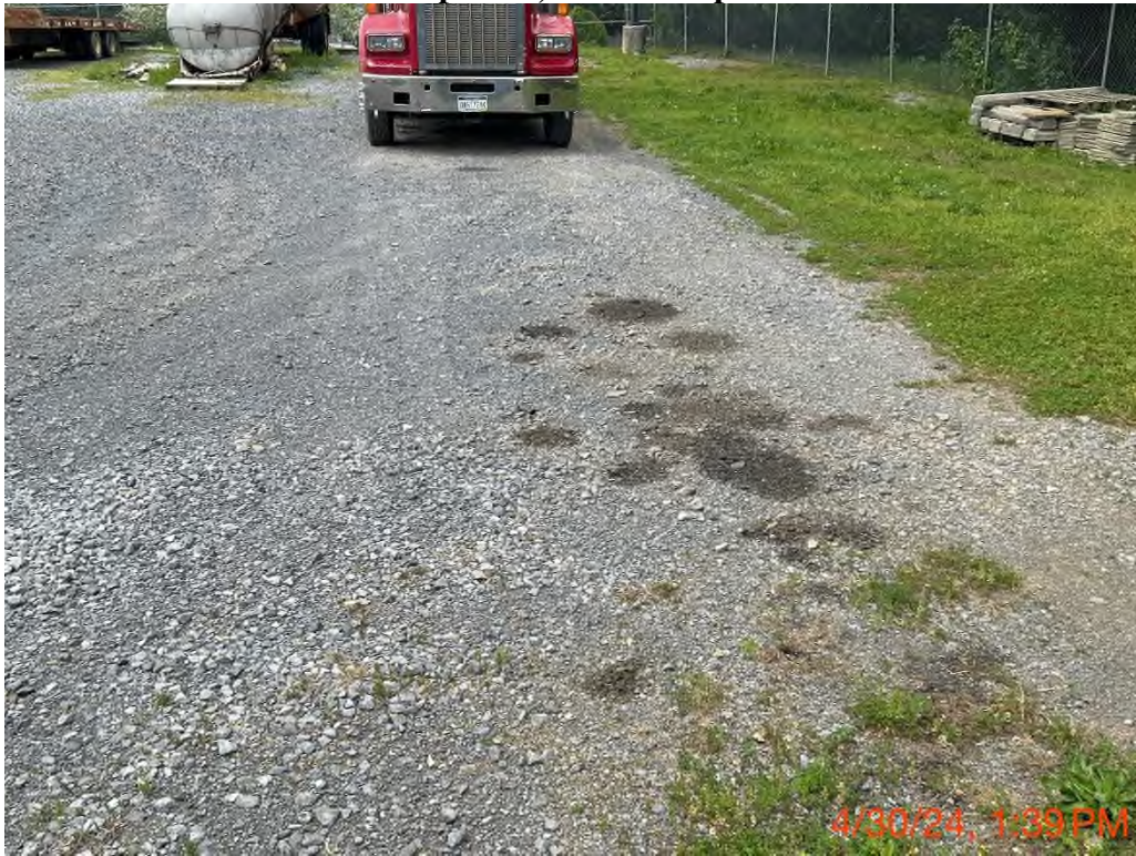
Petroleum staining on ground