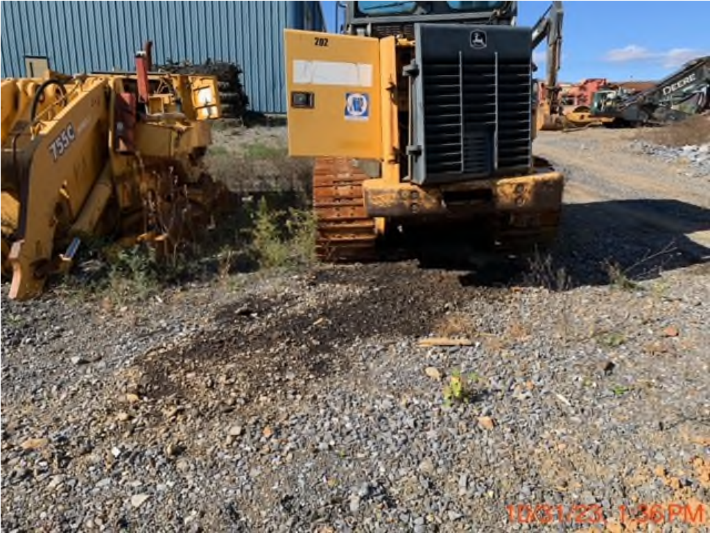
Petroleum on ground from dozer