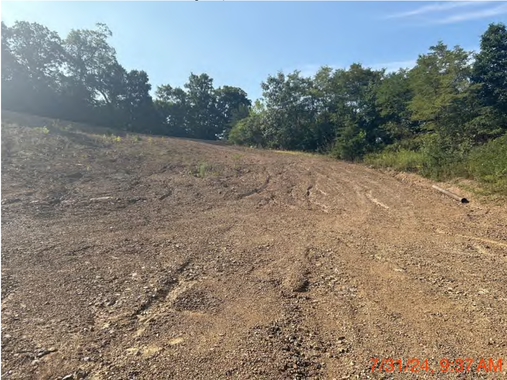
Erosion on south side of facility