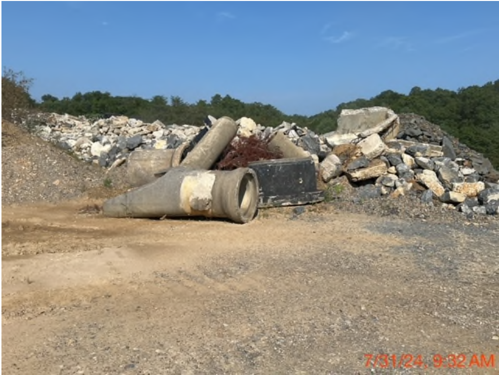
Concrete with rebar