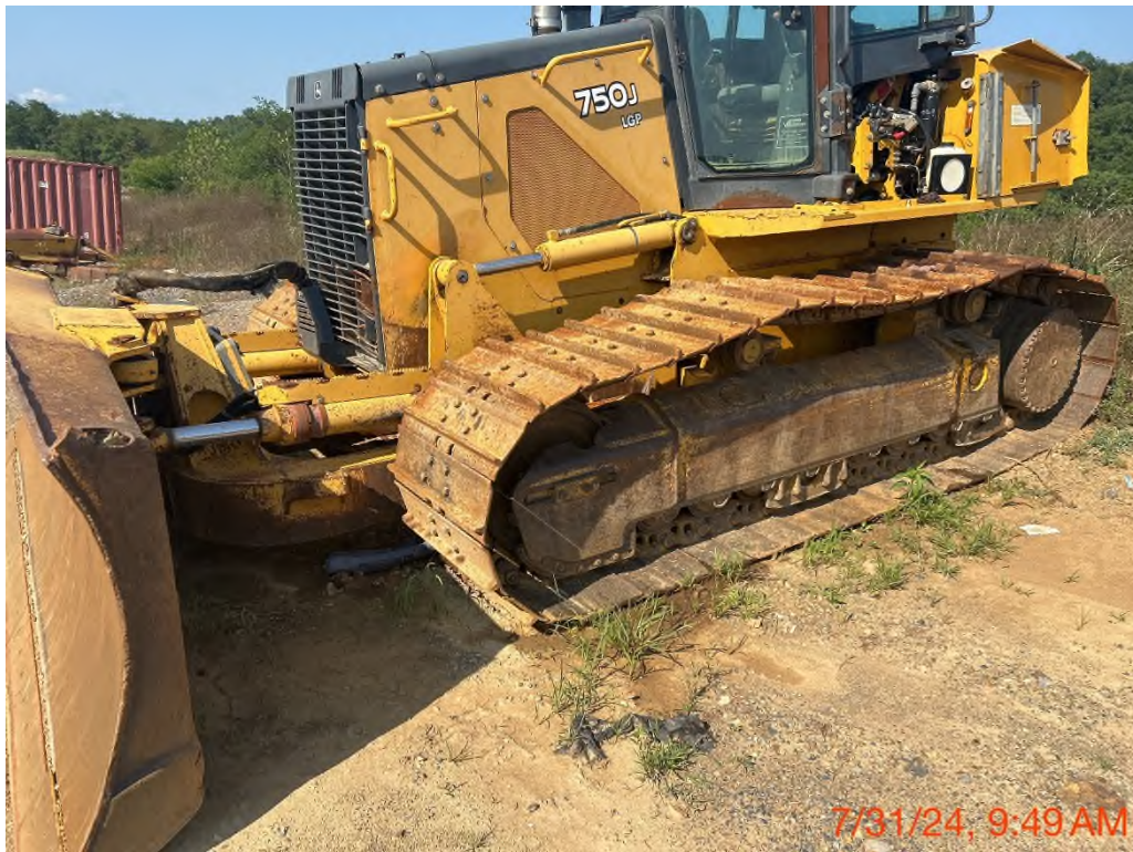
Petroleum staining under dozer