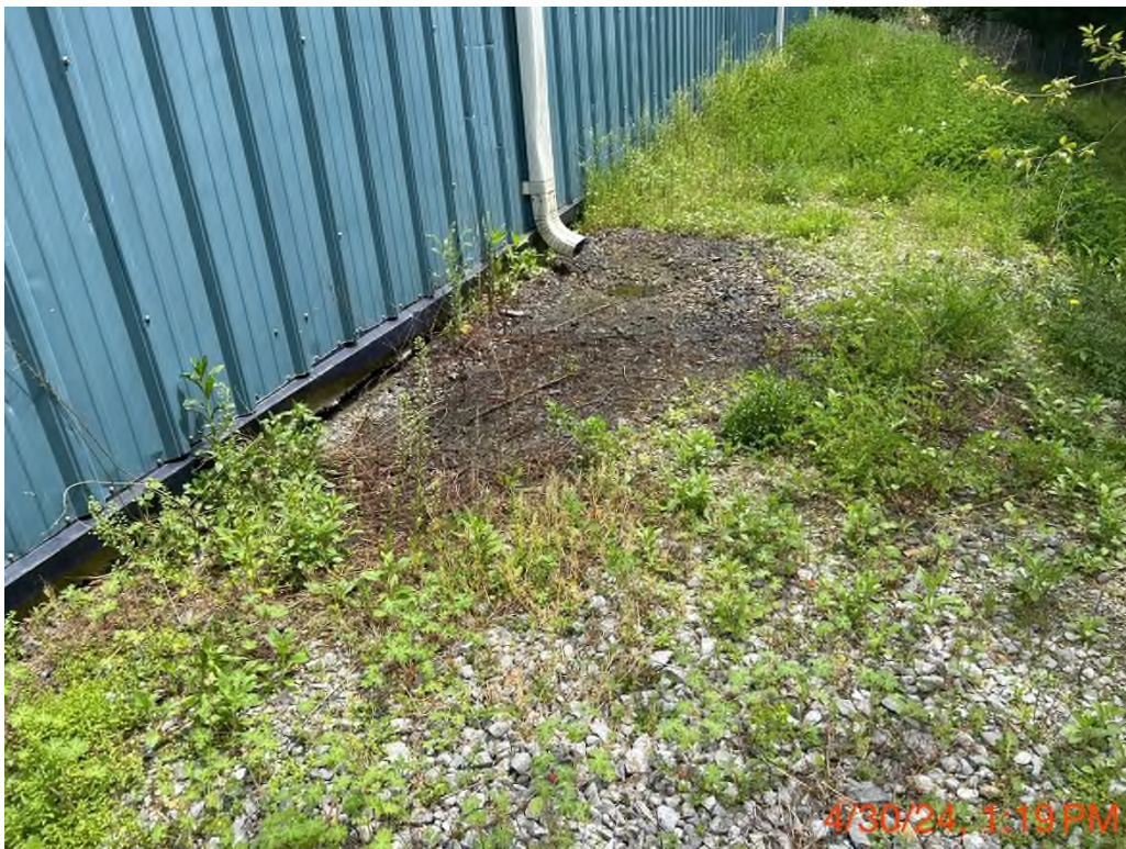
Petroleum stain along building