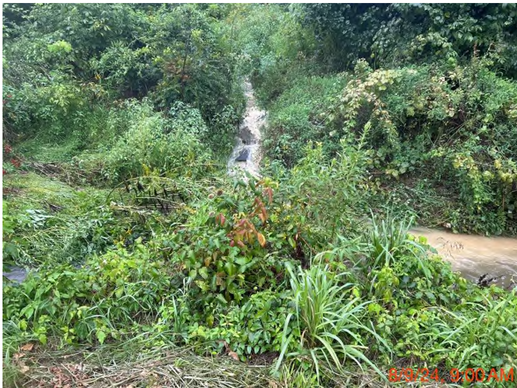
Outlet No. 004 discharging solids into receiving stream.