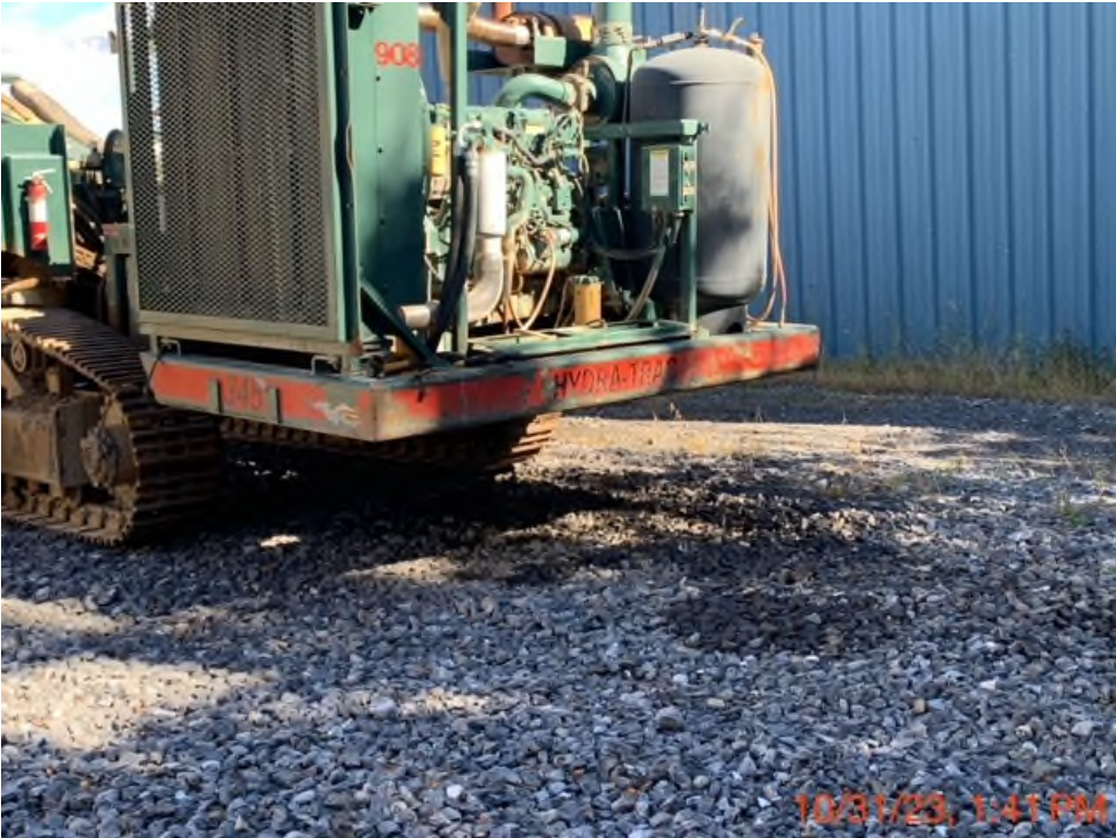
Petroleum on ground from equipment