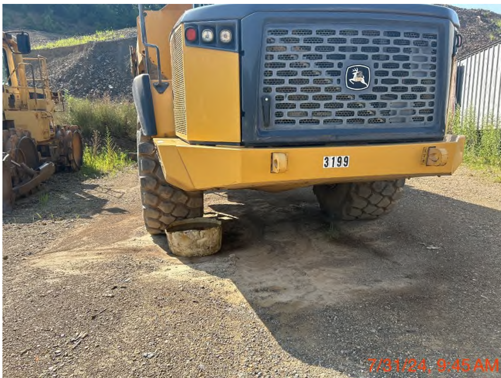
Petroleum staining on ground