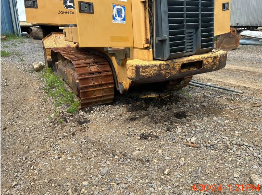
Petroleum staining under dozer