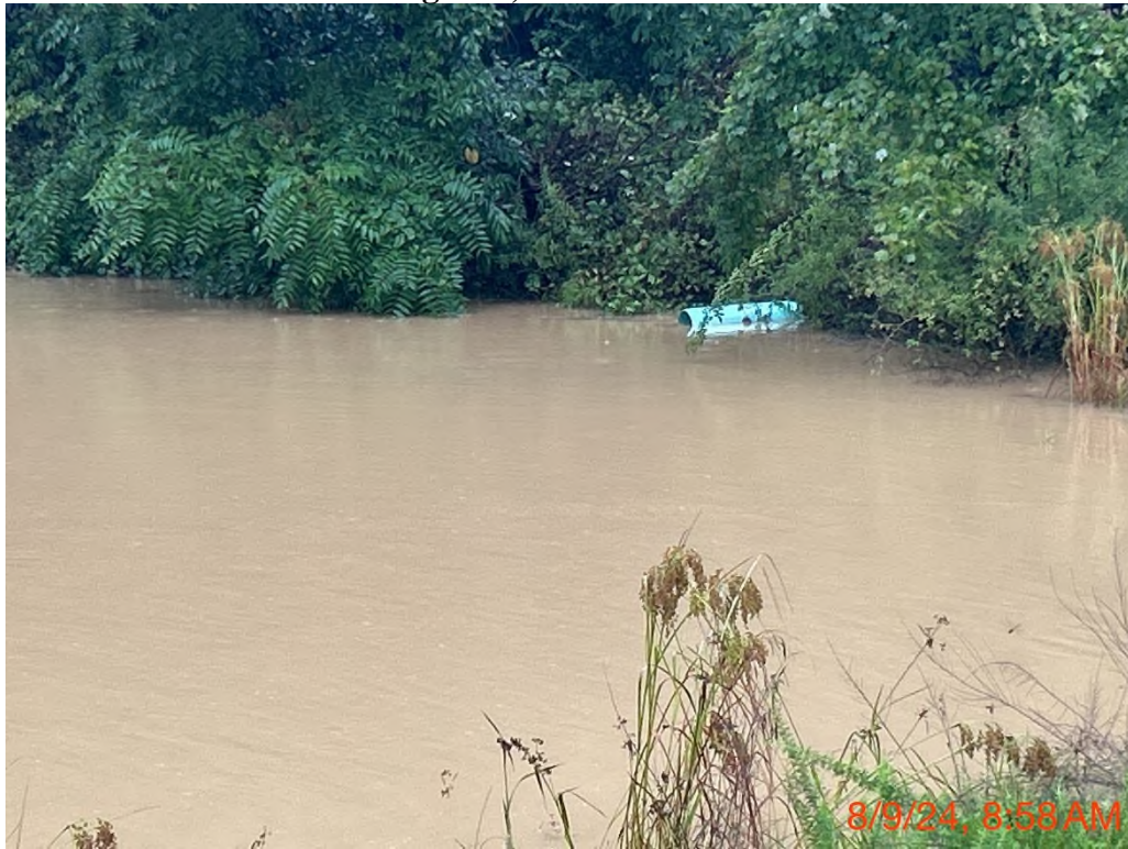
Sediment pond for Outlet No. 004