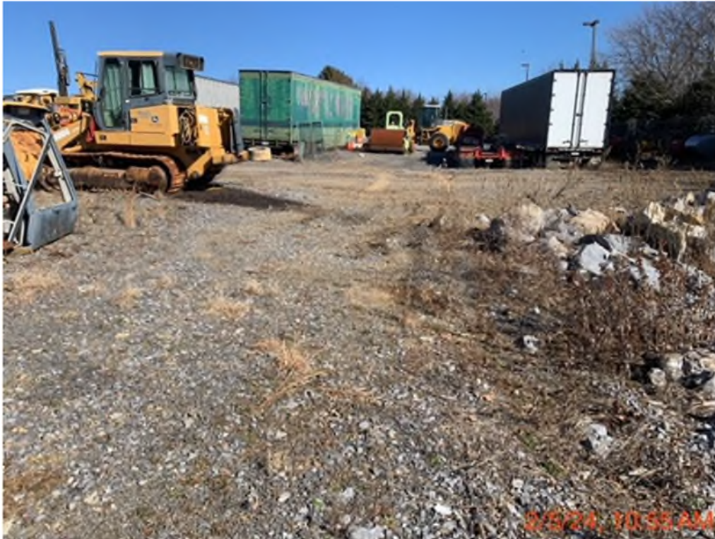
Large petroleum spill remains under dozer.