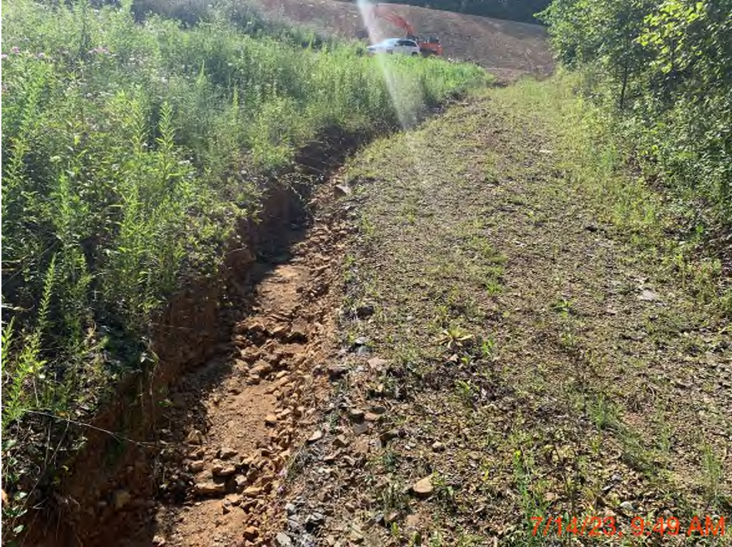
Erosion channel with no E&S controls