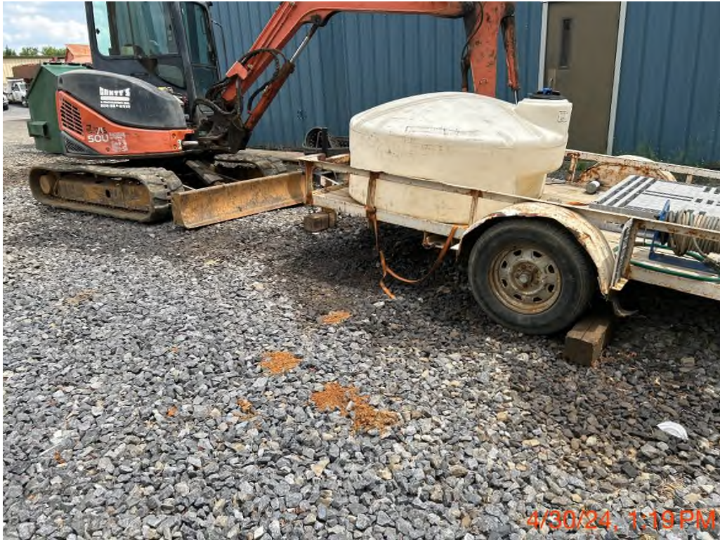
Large petroleum stain