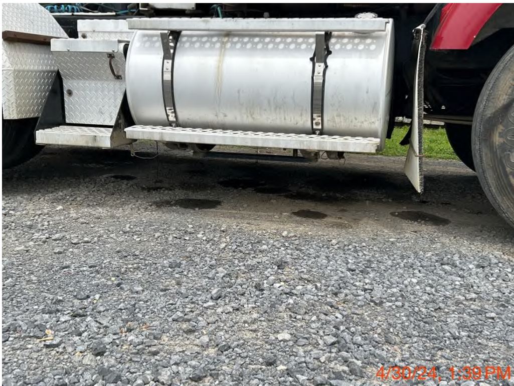
Petroleum staining under truck