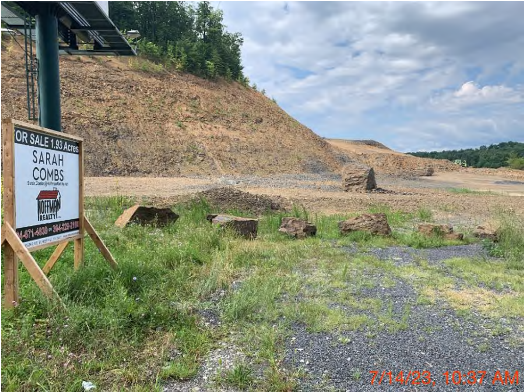
North section of the shale pit